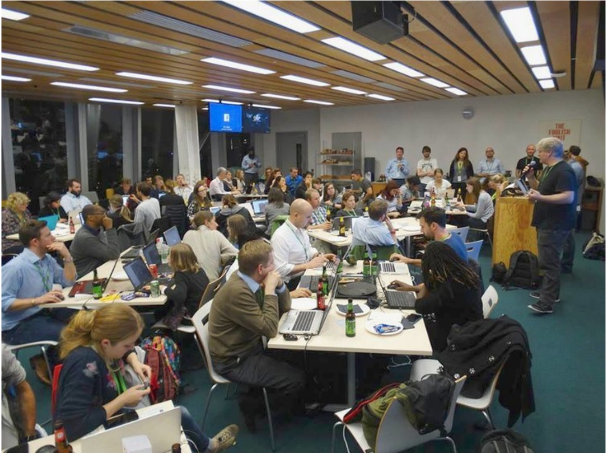
A Missing Maps project event at Facebook's London offices.

Data collaboratives like the Missing Maps project represent a new, contemporary model of corporate social responsibility .