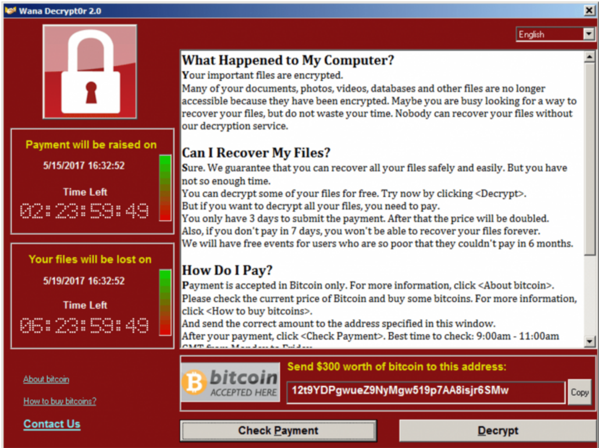
Wana Decrypt0r 2.0 Ransomware Screen.

Both outbreaks highlight the importance of practising diligent security and making sure that unsupported systems are upgraded or decommissioned.