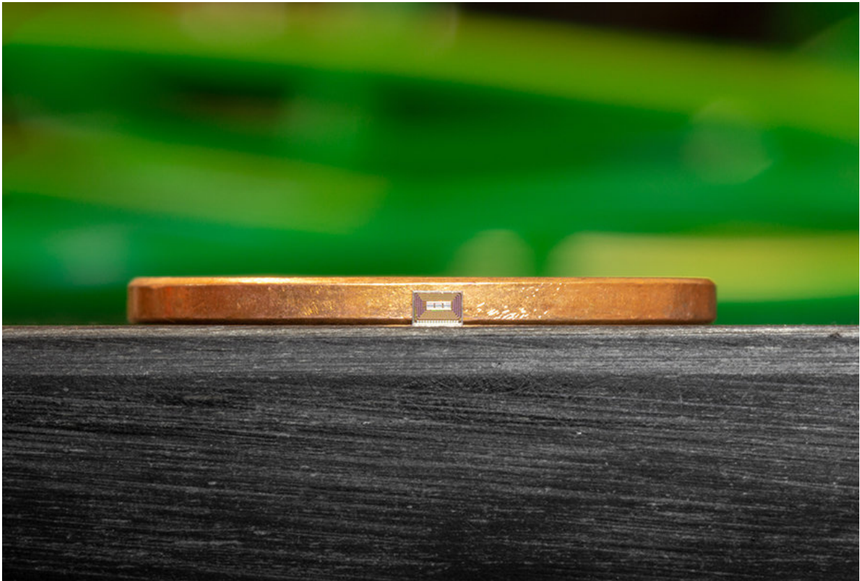
The chip compared to the thickness of a penny.