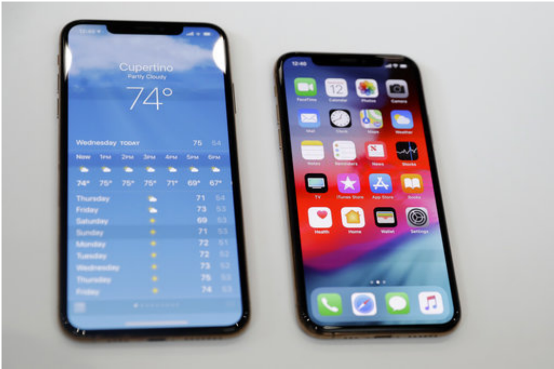
The iPhone XS, right, and XS Max are displayed side to side during an event to announce new products at Apple headquarters Wednesday, Sept. 12, 2018, in Cupertino, Calif.