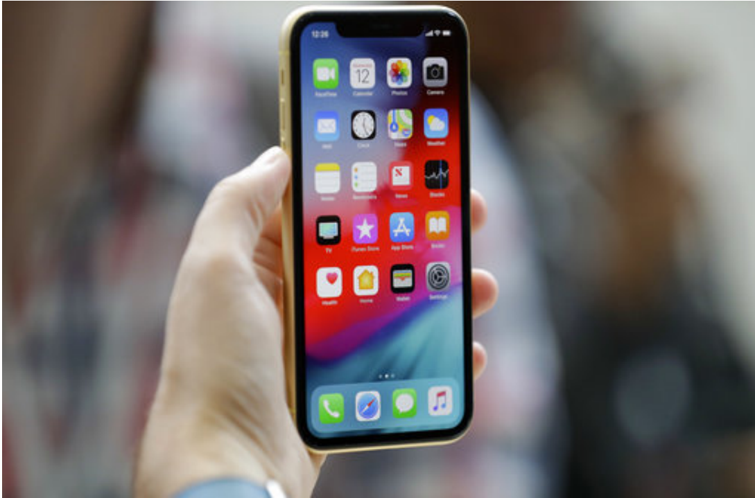
The new Apple iPhone XR is on display at the Steve Jobs Theater after an event to announce new products Wednesday, Sept. 12, 2018, in Cupertino, Calif.