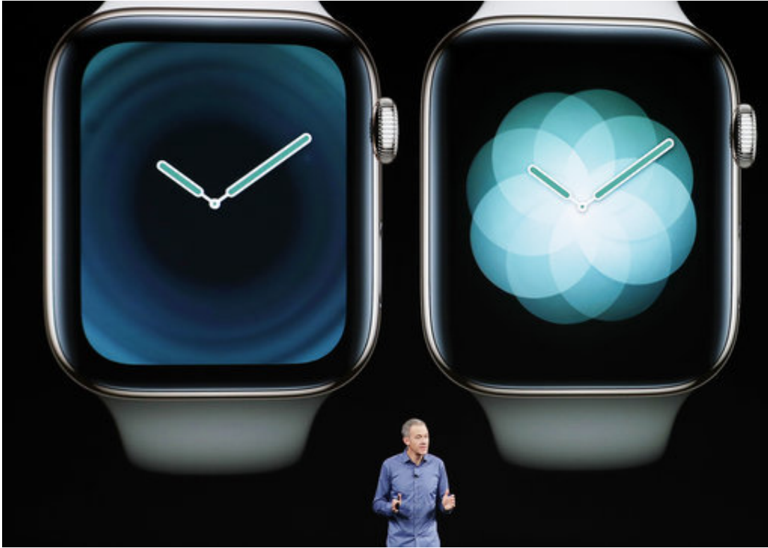
Jeff Williams, Apple's chief operating officer, speaks about the Apple Watch Series 4 at the Steve Jobs Theater during an event to announce new Apple products Wednesday, Sept. 12, 2018, in Cupertino, Calif.