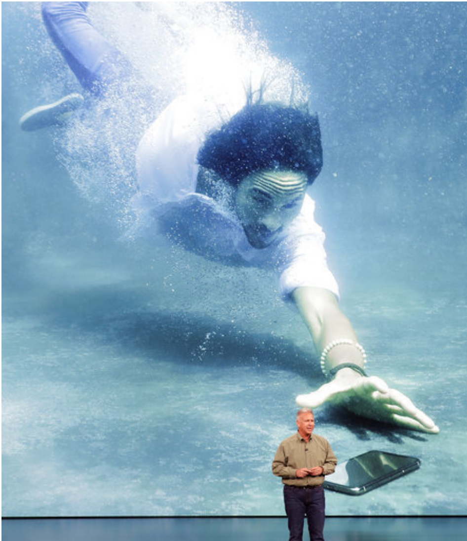
Phil Schiller, Apple's senior vice president of worldwide marketing, speaks about the camera on the Apple iPhone XS at the Steve Jobs Theater during an event to announce new Apple products Wednesday, Sept. 12, 2018, in Cupertino, Calif.