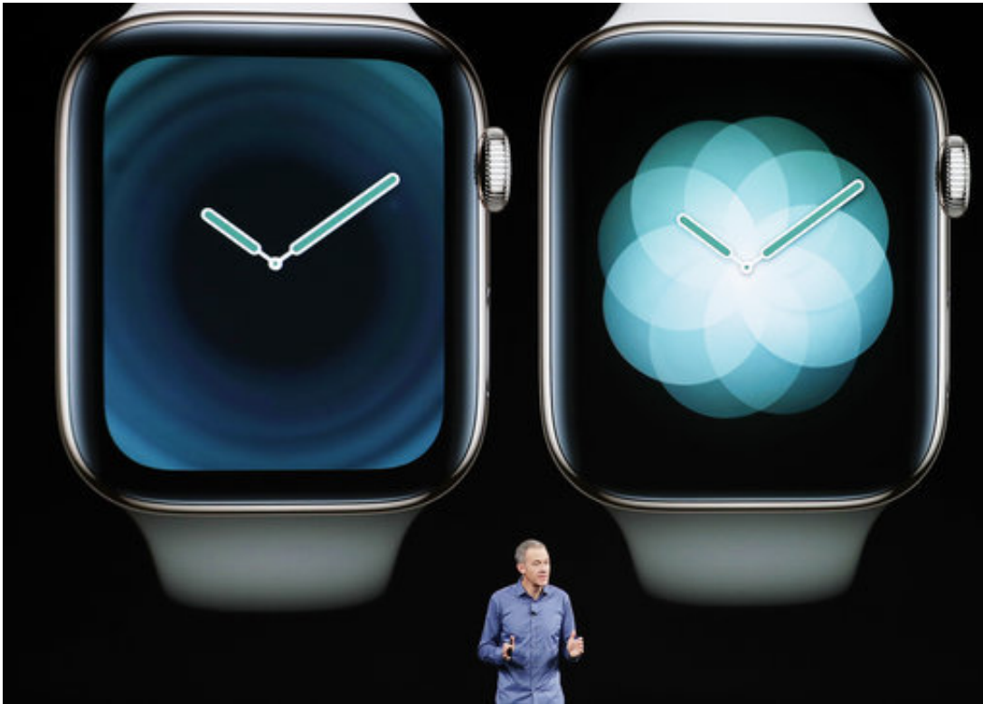
Jeff Williams, Apple's chief operating officer, speaks about the Apple Watch Series 4 at the Steve Jobs Theater during an event to announce new Apple products Wednesday, Sept. 12, 2018, in Cupertino, Calif.