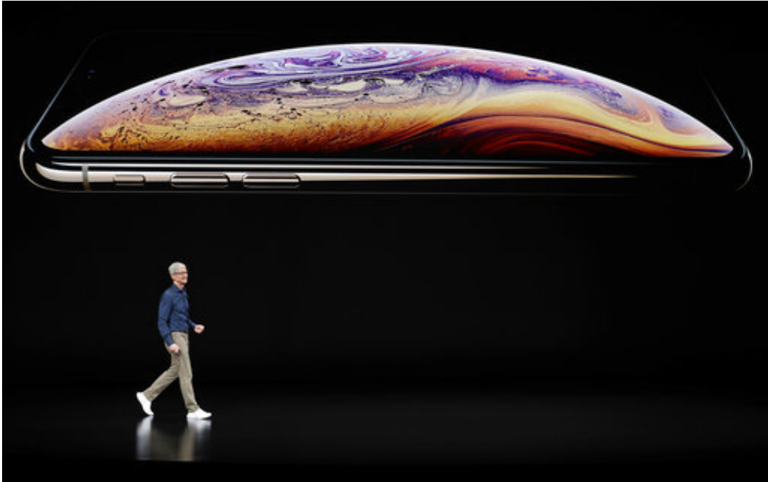
Apple CEO Tim Cook speaks about the Apple iPhone XS at the Steve Jobs Theater during an event to announce new Apple products Wednesday, Sept. 12, 2018, in Cupertino, Calif.