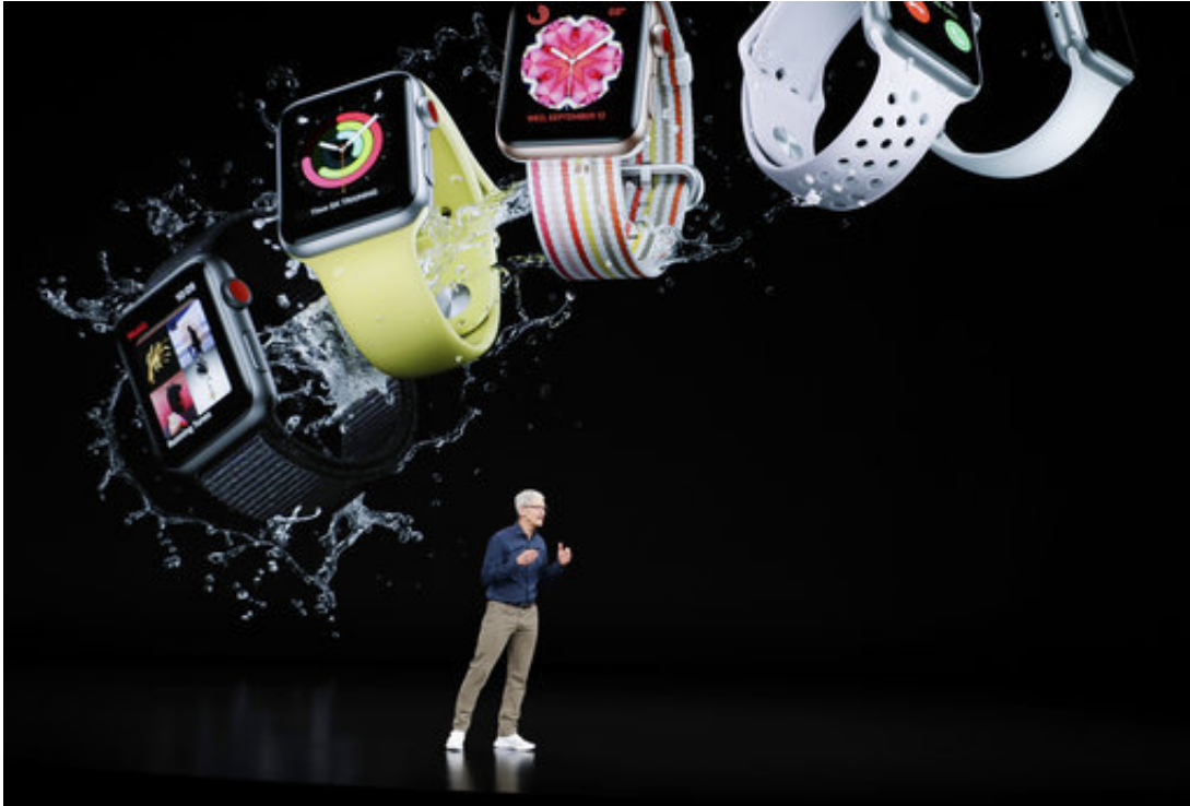
Apple CEO Tim Cook speaks about the Apple Watch at the Steve Jobs Theater during an event to announce new Apple products Wednesday, Sept. 12, 2018, in Cupertino, Calif.