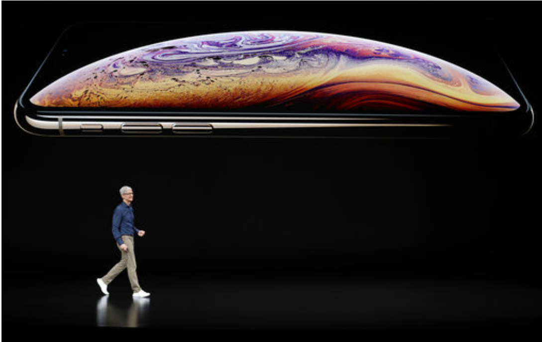
Apple CEO Tim Cook speaks about the Apple iPhone XS at the Steve Jobs Theater during an event to announce new Apple products Wednesday, Sept. 12, 2018, in Cupertino, Calif.