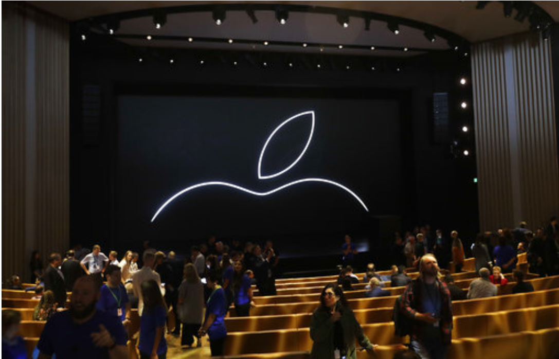
People file into the Steve Jobs Theater before an event to announce new Apple products Wednesday, Sept. 12, 2018, in Cupertino, Calif.