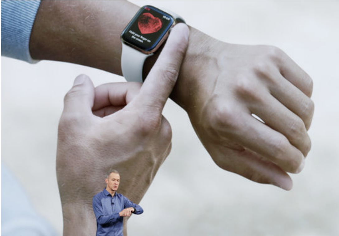
Jeff Williams, Apple's chief operating officer, speaks about the Apple Watch Series 4 at the Steve Jobs Theater during an event to announce new Apple products Wednesday, Sept. 12, 2018, in Cupertino, Calif.