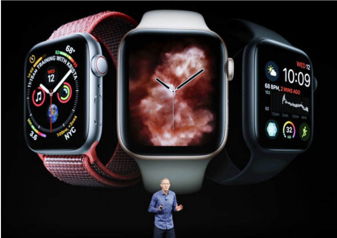
Jeff Williams, Apple's chief operating officer, speaks about the Apple Watch Series 4 at the Steve Jobs Theater during an event to announce new Apple products Wednesday, Sept. 12, 2018, in Cupertino, Calif.