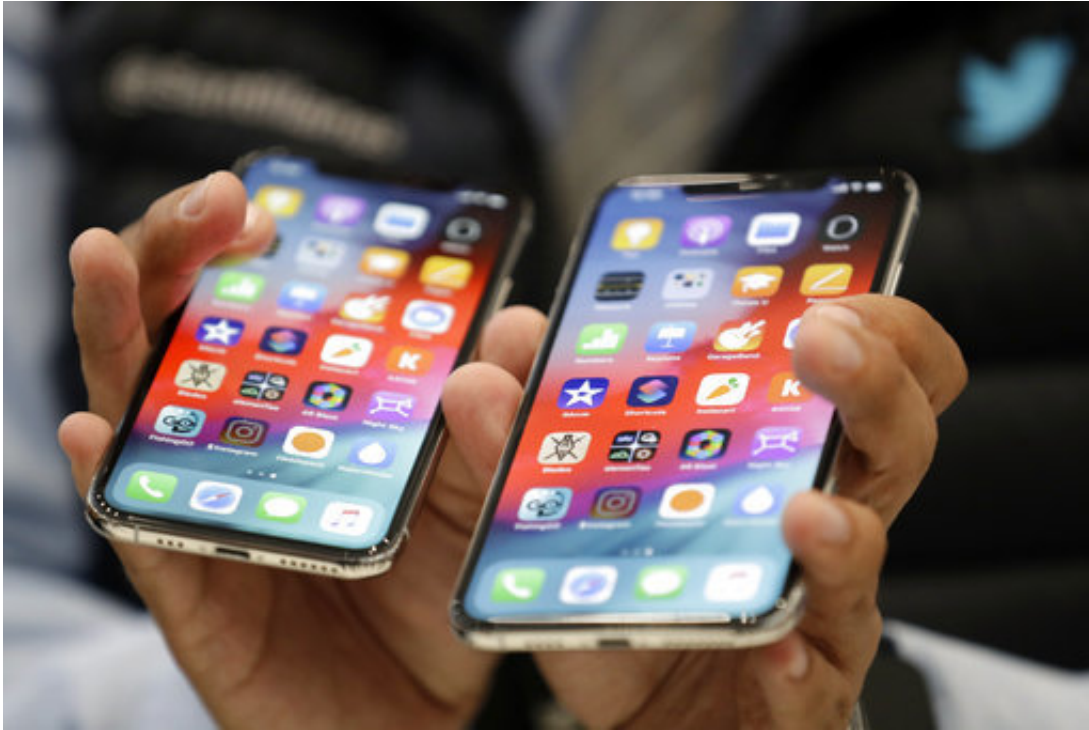
The iPhone XS, left, and XS Max are displayed side to side during an event to announce new products at Apple headquarters Wednesday, Sept. 12, 2018, in Cupertino, Calif.