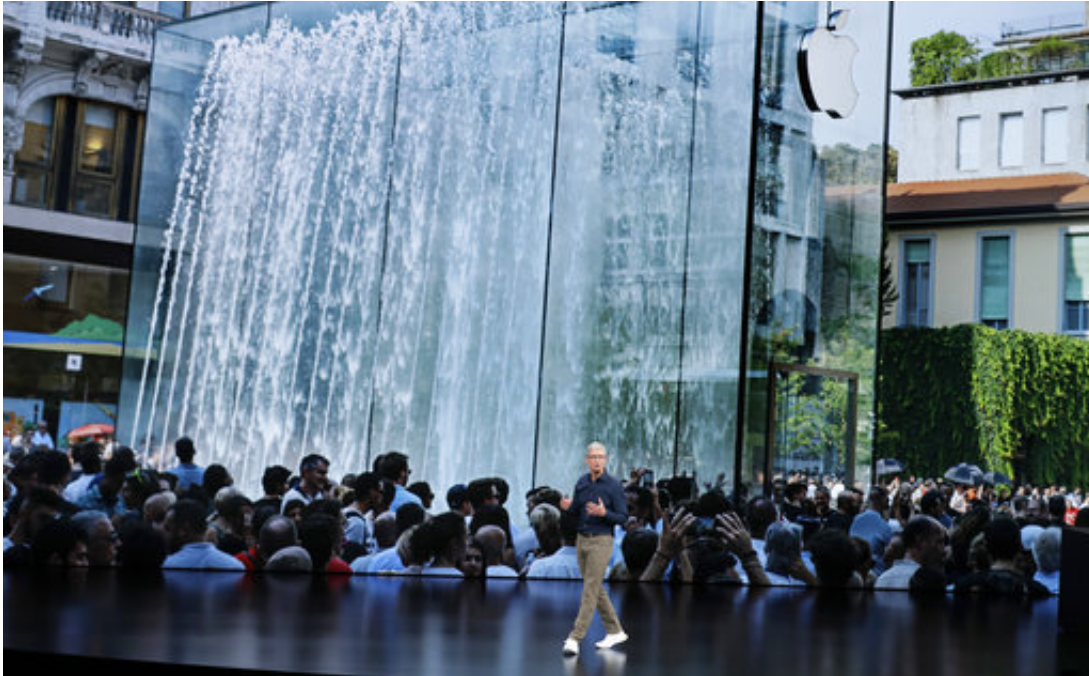
Apple CEO Tim Cook speaks at the Steve Jobs Theater during an event to announce new Apple products Wednesday, Sept. 12, 2018, in Cupertino, Calif.