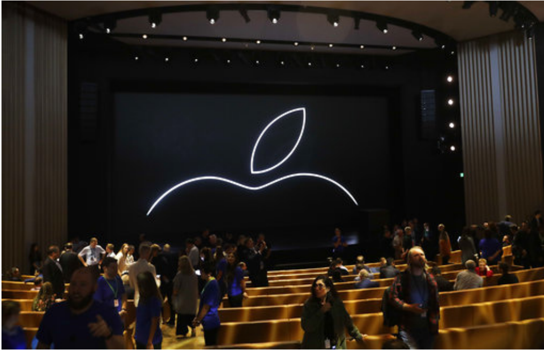
People file into the Steve Jobs Theater before an event to announce new Apple products Wednesday, Sept. 12, 2018, in Cupertino, Calif.