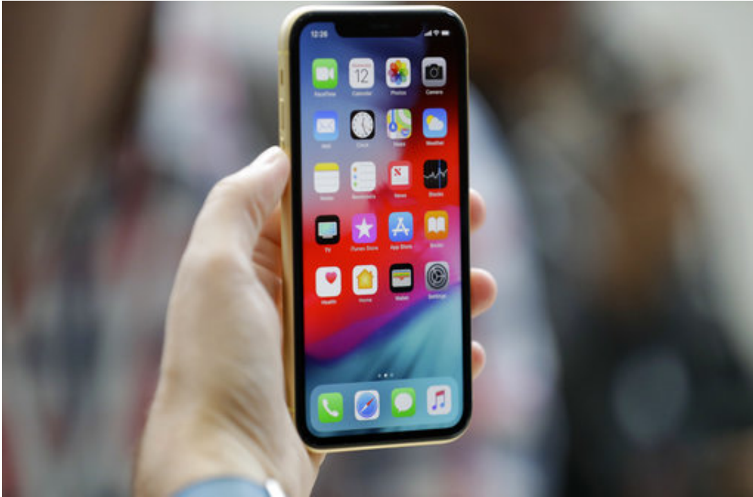
At the Steve Jobs Theater during an event to announce new products Wednesday, Sept. 12, 2018, in Cupertino, Calif.