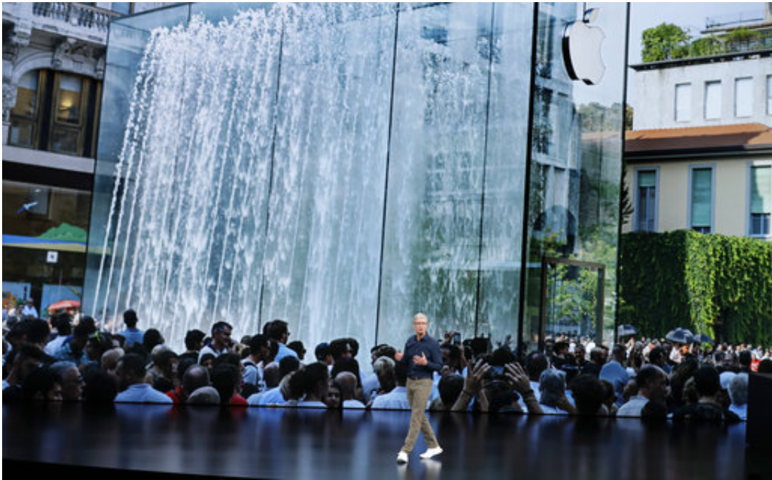
Apple CEO Tim Cook speaks at the Steve Jobs Theater during an event to announce new Apple products Wednesday, Sept. 12, 2018, in Cupertino, Calif.