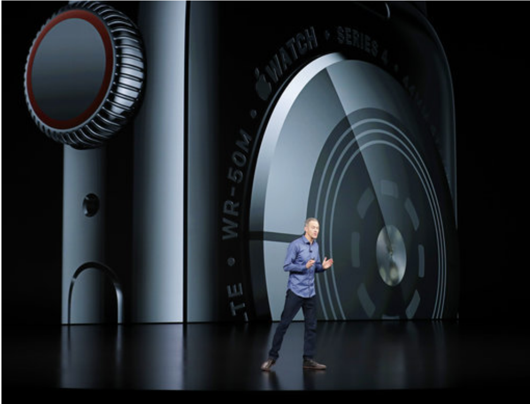
Jeff Williams, Apple's chief operating officer, speaks about the Apple Watch Series 4 at the Steve Jobs Theater during an event to announce new Apple products Wednesday, Sept. 12, 2018, in Cupertino, Calif.