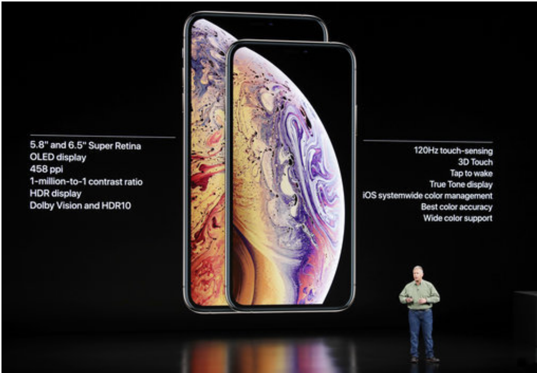
Phil Schiller, Apple's senior vice president of worldwide marketing, speaks about the Apple iPhone XS and Apple iPhone XS Max at the Steve Jobs Theater during an event to announce new Apple products Wednesday, Sept. 12, 2018, in Cupertino, Calif.