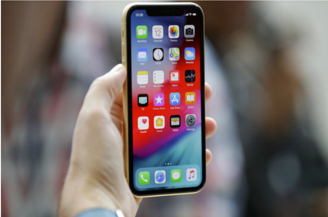
At the Steve Jobs Theater during an event to announce new products Wednesday, Sept. 12, 2018, in Cupertino, Calif.