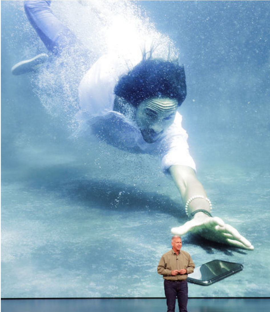
Phil Schiller, Apple's senior vice president of worldwide marketing, speaks about the camera on the Apple iPhone XS at the Steve Jobs Theater during an event to announce new Apple products Wednesday, Sept. 12, 2018, in Cupertino, Calif.