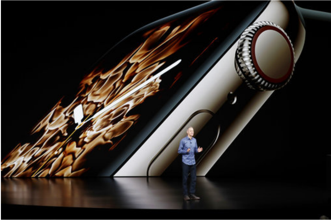
Jeff Williams, Apple's chief operating officer, speaks about the Apple Watch Series 4 at the Steve Jobs Theater during an event to announce new Apple products Wednesday, Sept. 12, 2018, in Cupertino, Calif.