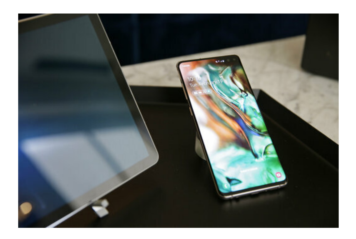
In this Tuesday, Feb. 19, 2019, photo is a Samsung Galaxy S10+ smartphone during a product preview in San Francisco.