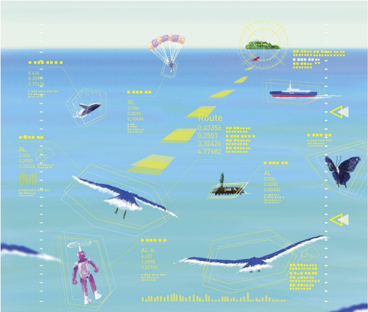
AI analysis of movement. Conceptual drawing of 'AI analysis of movement.' Credit: Kotaro Kimura