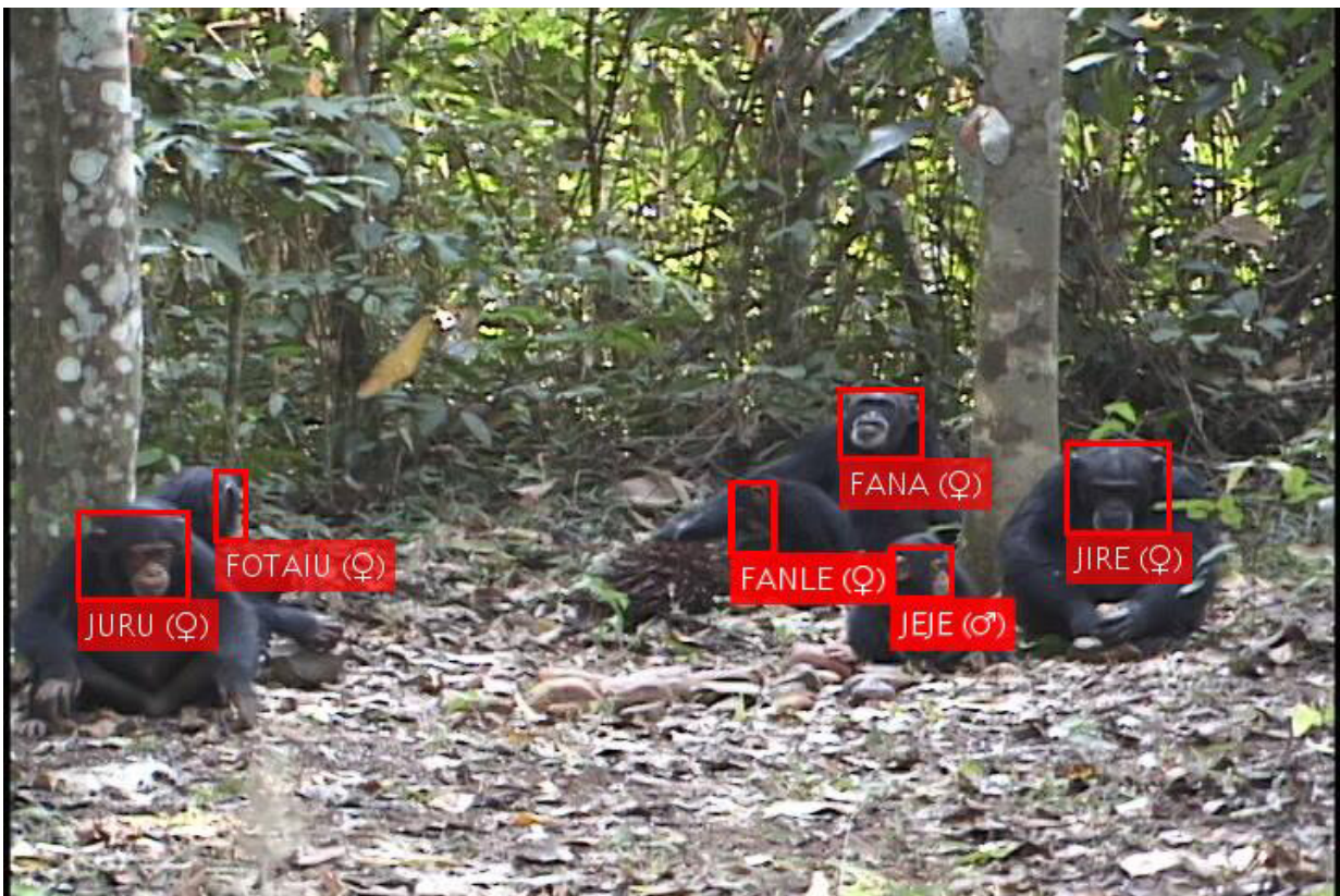
Face recognition of individual chimpanzees from Bossou, Guinea.