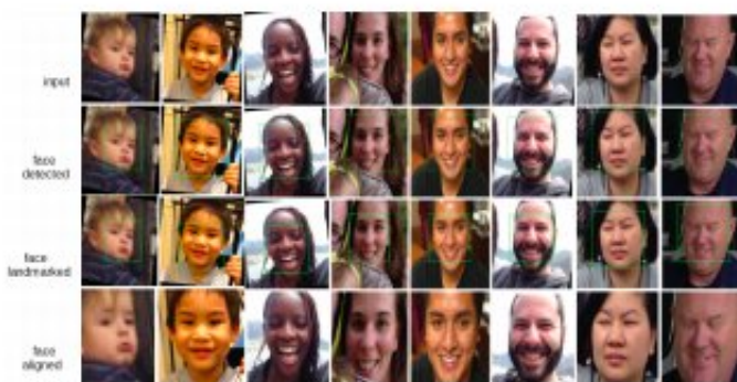
The image preprocessing phase.

The team of researchers at the University of Kwazulu-Natal developed a deep convolutional neural network (CNN)-based architecture with six layers. Their model was trained to estimate the age of individuals from images of faces taken in uncontrolled environments. The architecture achieves this by learning what facial representations are most crucial for age estimation and focusing on these particular features.