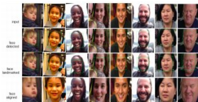
The image preprocessing phase.

The team of researchers at the University of Kwazulu-Natal developed a deep convolutional neural network (CNN)-based architecture with six layers. Their model was trained to estimate the age of individuals from images of faces taken in uncontrolled environments. The architecture achieves this by learning what facial representations are most crucial for age estimation and focusing on these particular features.