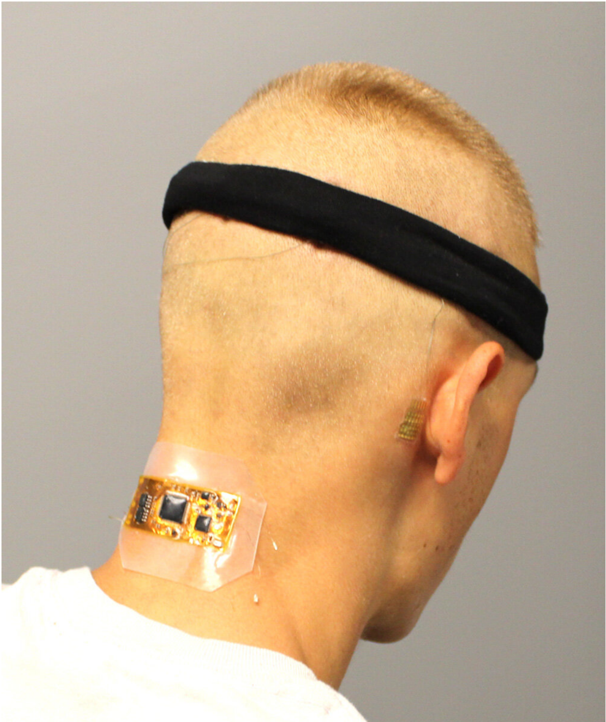
Test subject who has flexible wireless electronics conformed to the back of the neck, with dry hair electrodes under a fabric headband and a membrane electrode on the mastoid, connected with thin-film cables.