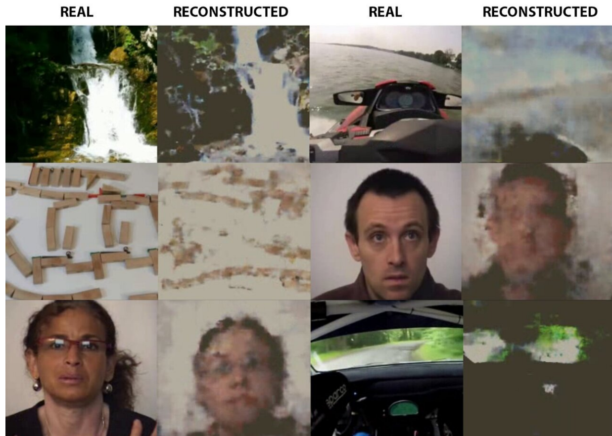
Figure 1. Each pair presents a frame from a video watched by a test subject and the corresponding image generated by the neural network based on brain activity.