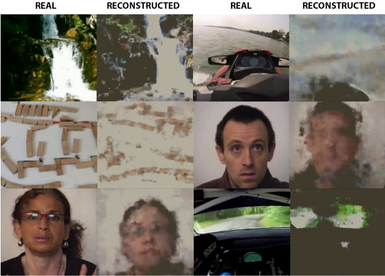
Figure 1. Each pair presents a frame from a video watched by a test subject and the corresponding image generated by the neural network based on brain activity.