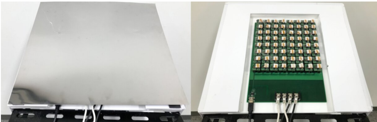
Fig. 3. StickyTouch covered with a stainless-steel plate (left) and StickyTouch uncovered (right).