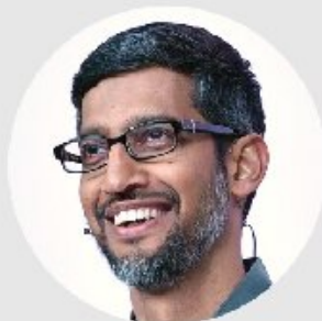
Sundar Pichai Age 47

Announced as Alphabet CEO on Dec 3, 2019