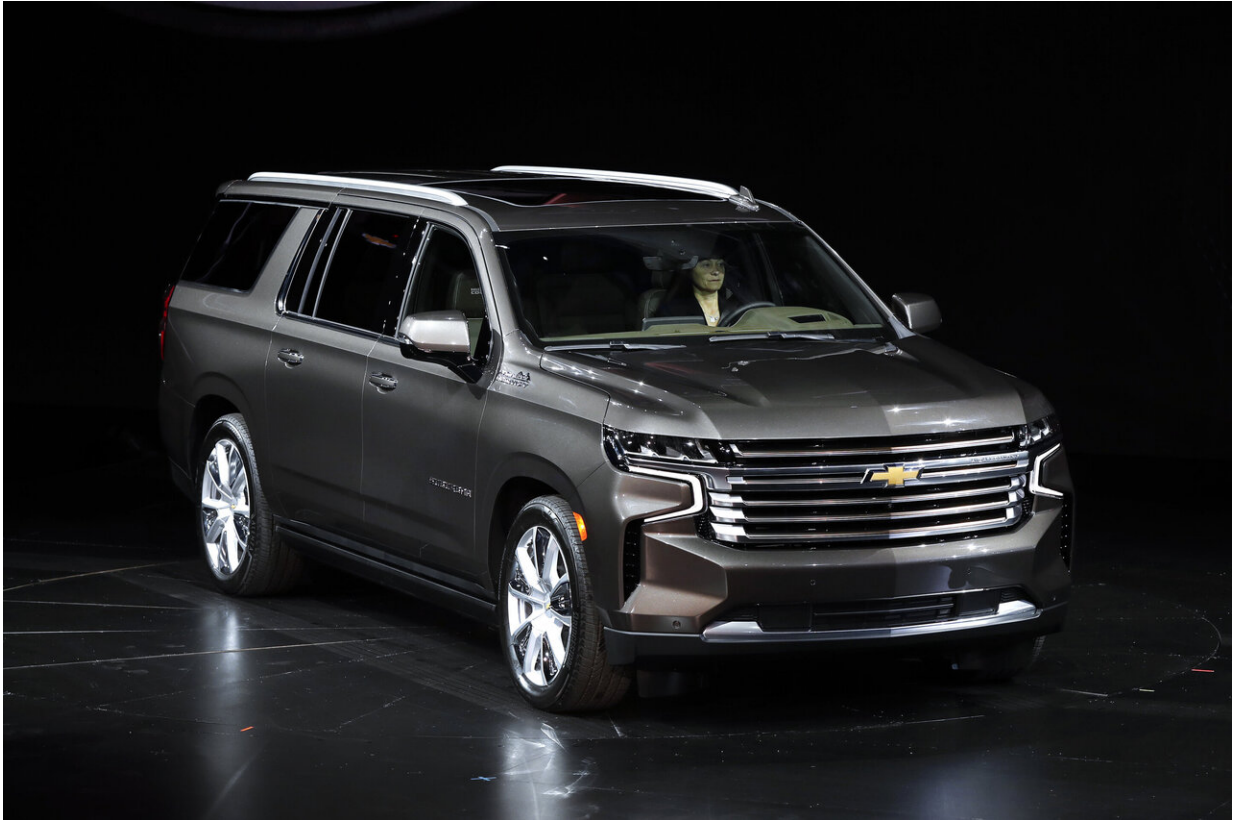
The 2021 Chevrolet Suburban High Country is unveiled in Detroit, Tuesday, Dec. 10, 2019.

The overwhelming majority of climate scientists, organizations of professional scientists and peer reviewed research show that heat-trapping gases from burning coal, oil and gas are causing the climate to change with worsening weather extremes, rising seas and changes in ocean chemistry. The Nobel prize winning Intergovernmental Panel on Climate Change and the U.S. National Climate Assessment calculate that nearly all the warming—nearly 2 degrees (1.1 degrees Celsius) globally since the late 1800s—is from greenhouse gases. The five hottest years on record are the last five years with this year on pace to be the second warmest, after 2016, according to U.S. science agencies.