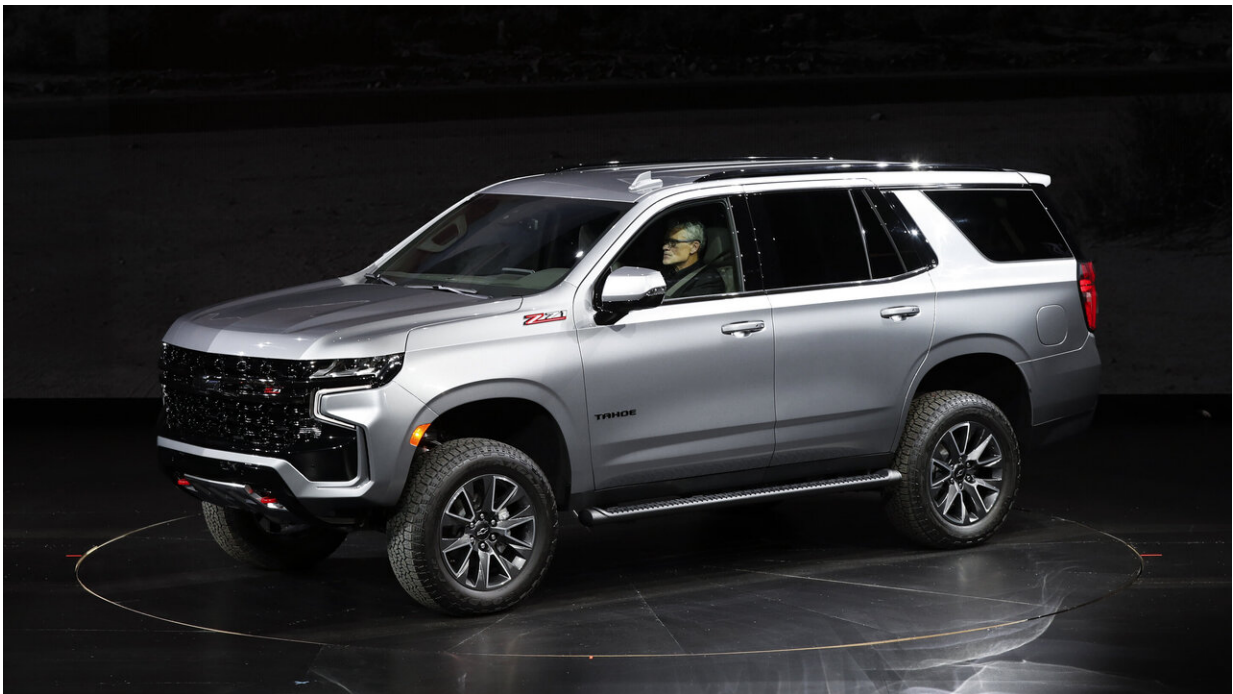
The 2021 Chevrolet Tahoe Z71 is unveiled in Detroit, Tuesday, Dec. 10, 2019.

Yet even with the additions, mileage will get "incrementally" better, Schoenefeld said. GM said it doesn't have government-certified mileage numbers yet. All versions will have 10-speed automatic transmissions, more efficient than the current six-speed gearboxes. GM will offer a 355-horsepower 5.3-liter V8, a 420-horsepower 6.2-liter V8 or a more efficient 277-horsepower, six-cylinder 3-liter diesel engine.