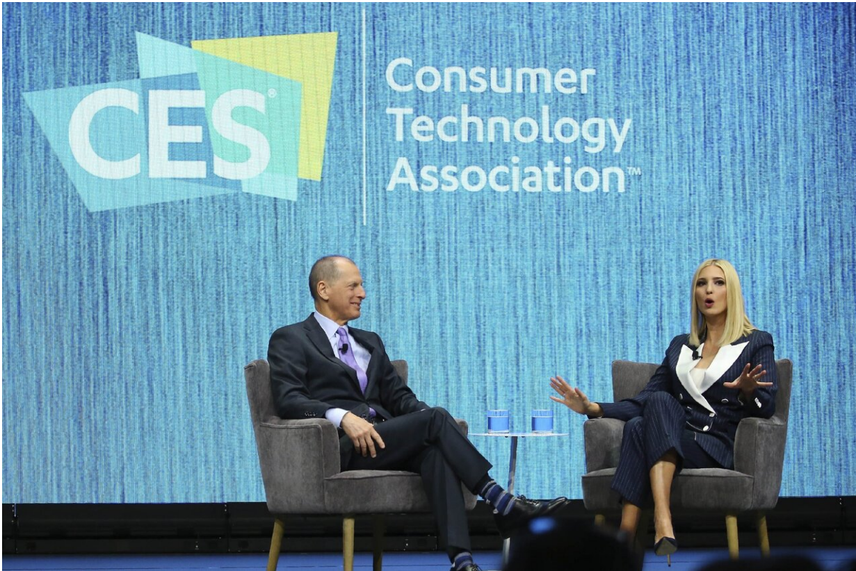
Ivanka Trump, right, the daughter and senior adviser to U.S. President Donald Trump, answers a question as she is interviewed by Gary Shapiro, left, CEO of the Consumer Technology Association, at the Consumer Technology Association Keynote during the CES tech show Tuesday, Jan. 7, 2020, in Las Vegas.