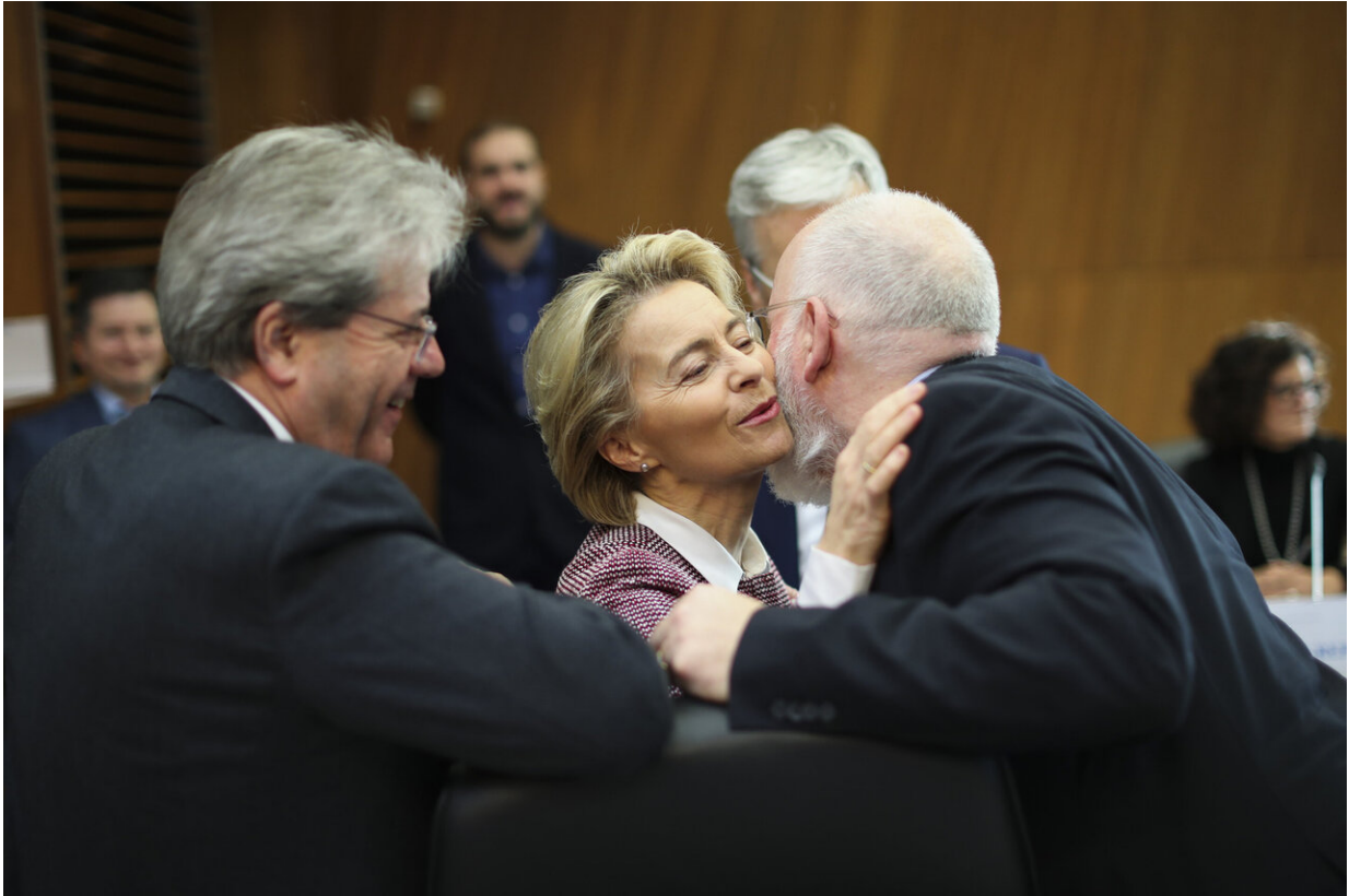
European Commission President Ursula von der Leyen, center, greets Commissioner for European Green Deal Frans Timmermans, right, next to Commissioner for Economy Paolo Gentiloni during a weekly College of Commissioners meeting at the EU headquarters in Brussels, Wednesday, Feb. 19, 2020. During the meeting, the College will set out plans on the EU's strategy to deal with the challenges of the digital age and the use of artificial intelligence.