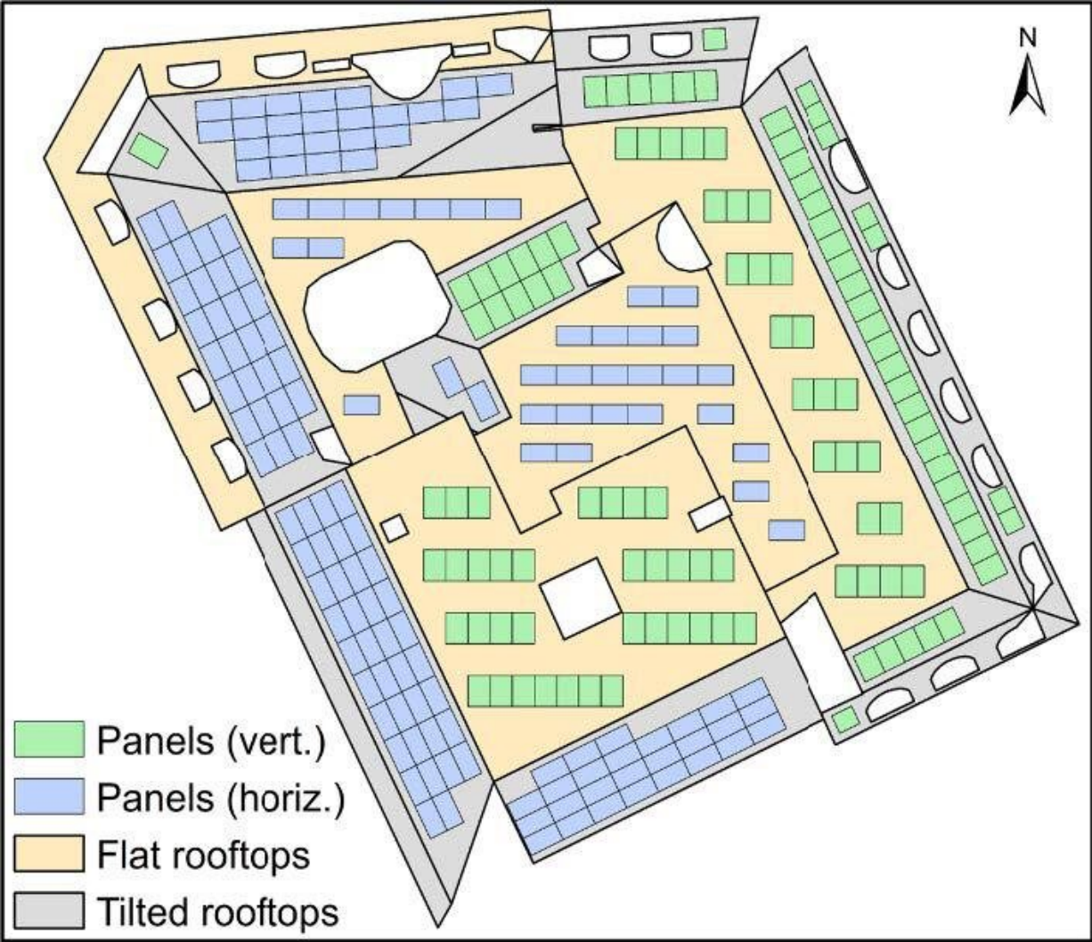
Solar panels adapted to the different geometries of the roofs.