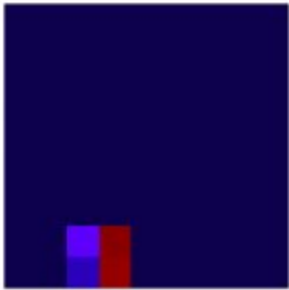
(b) Gaze heatmap