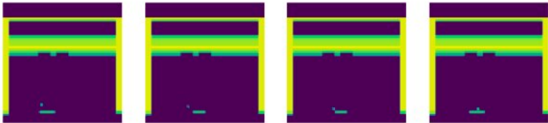
(a) Input image stack