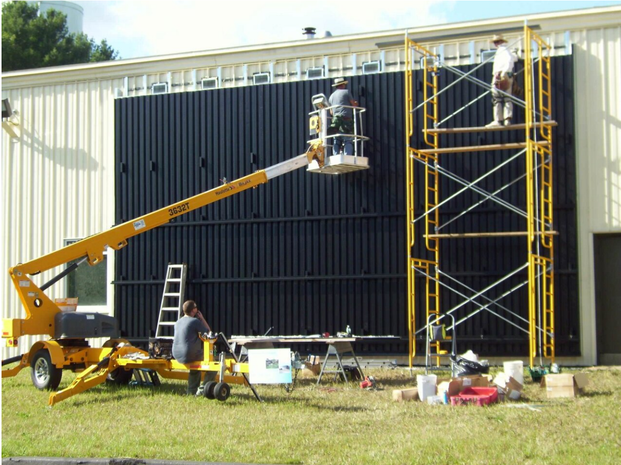
The installation of a solar wall at Wicked Joe's roastery in Maine.

One application of that data was by the Pennsylvania school district of Palmyra. When they uploaded two years of energy bills into the RETScreen, they were able to confirm that the energy use from those buildings correlated with NASA's long-term Earth science data. That information then let them predict possible values of energy savings they would receive by making their buildings more sustainable.