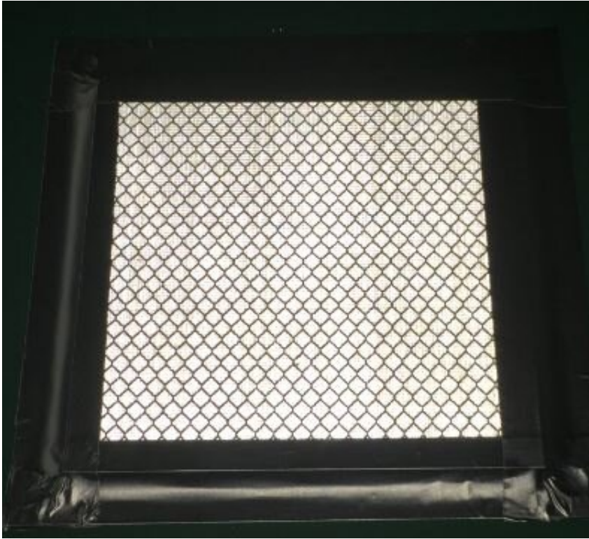
Surface appearance and structure of RR plate.

experiment in the research. The results of this research were published in the Elsevier journal Energy & Buildings on September 15, 2020.