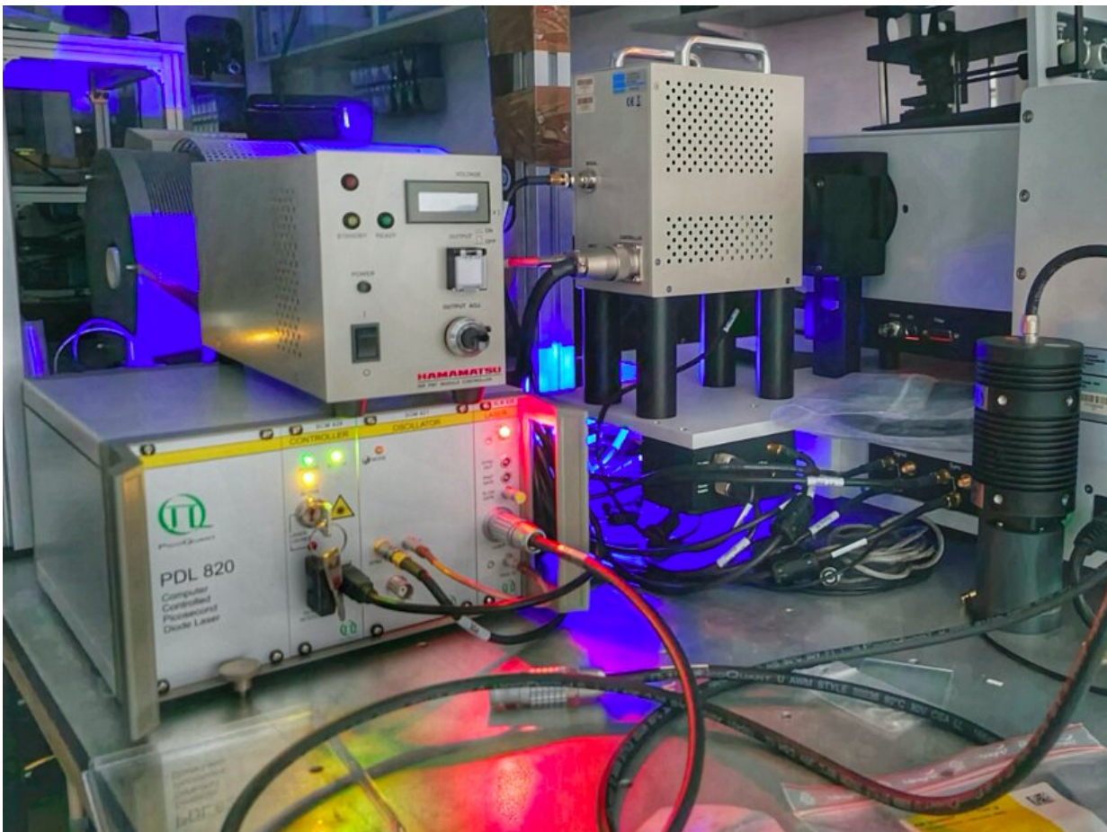
The equipment used by Andrej Classen to measure the exciton lifetime.