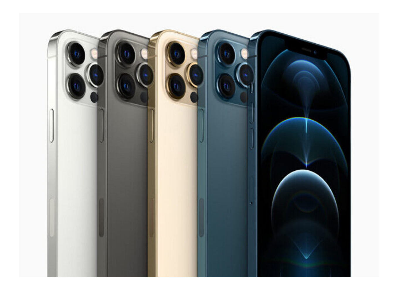
The iPhone 12 Pro Max

On the other side of the spectrum, the iPhone 12 Pro Max sports a 6.7-inch screen, setting a new record for iPhone sizes. The iPhone 12 and 12 Pro models have 6.1-inch screens.