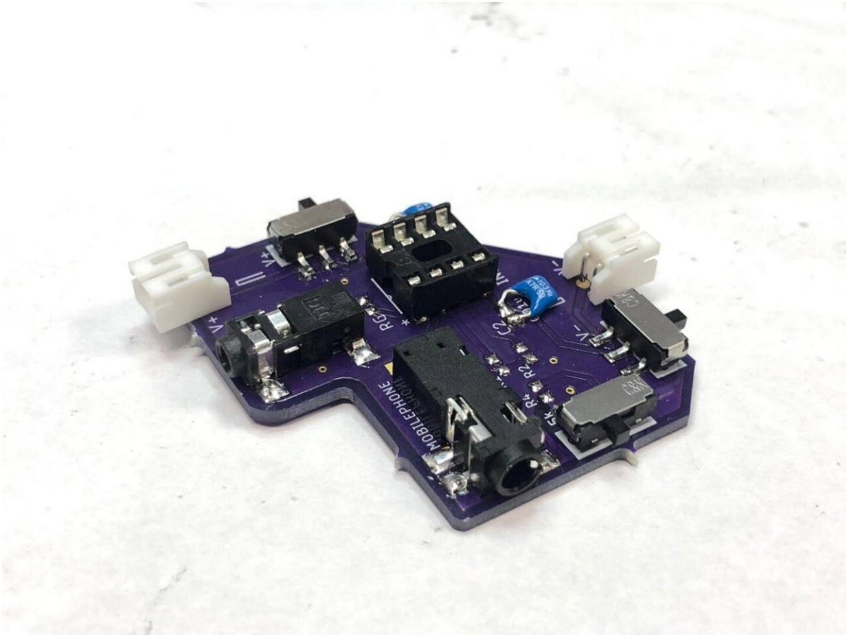
The HeadFi prototype.

HeadFi turns the two drivers already inside all headphones into a versatile sensor, and it works by connecting headphones to a pairing device, such as a smartphone. It does not require adding auxiliary sensors and avoids changes to headphone hardware or the need to customize headphones, both of which may increase their weight and bulk. By plugging into HeadFi, a converted headphone can perform sensing tasks and play music at the same time.