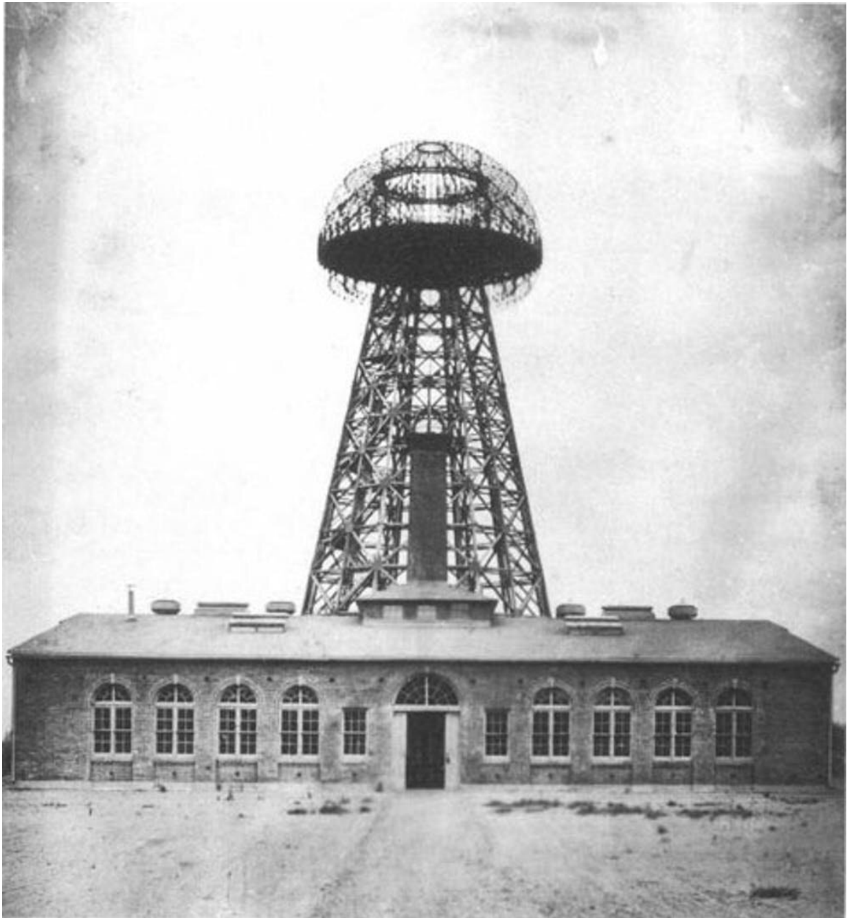
One of Tesla's towers, photographed in 1904.

At the height of his career, the pioneering electrical engineer Nikola Tesla became obsessed with an idea. He theorized that electricity could