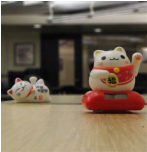
Ours focused on foreground