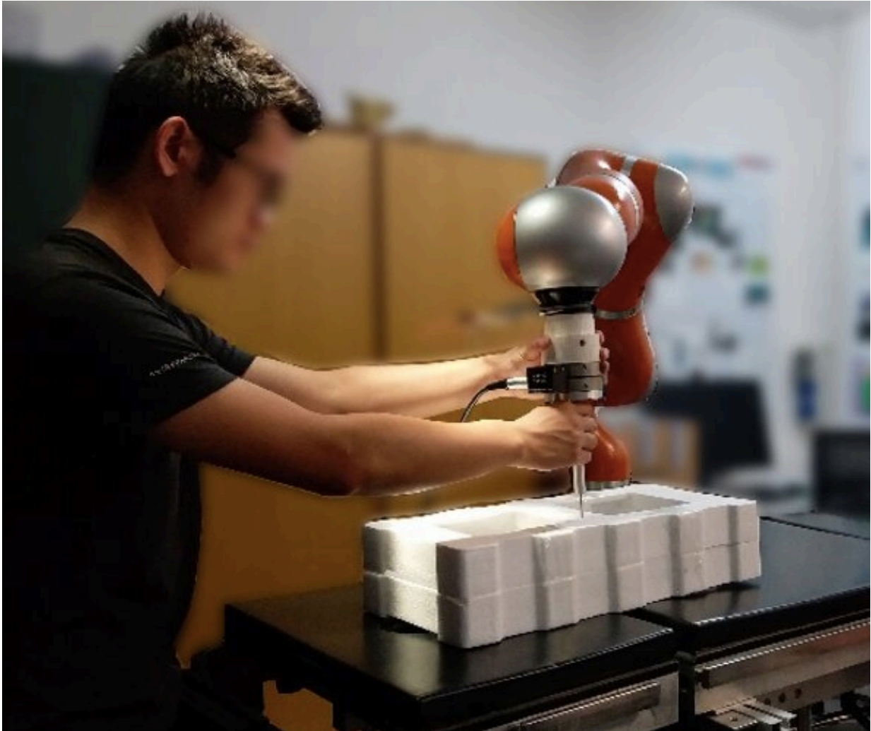
A human user teaching a robot to perform an insertion task.

"Our work focuses on the topic of how to enable robots to learn compliant manipulation skills from humans," Professor Yang said. "The core goal of our research was to develop learning and control approaches allowing robots to deal with physical interactions and contact-rich tasks in a compliant manner."