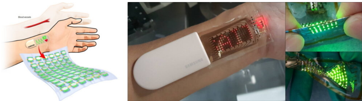
Samsung stretchable device.

In fact, the research team at Samsung managed to implement a stretchable organic LED (OLED) display and a photoplethysmography (PPG) sensor into just one device to measure and display the user's heart rate in real time. This process allowed for an electronic stretchable device capable of assessing bodily metrics via the skin.