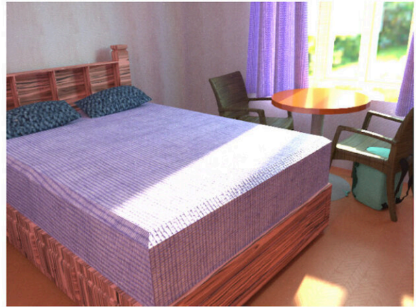
Photorealistic Synthetic Scene