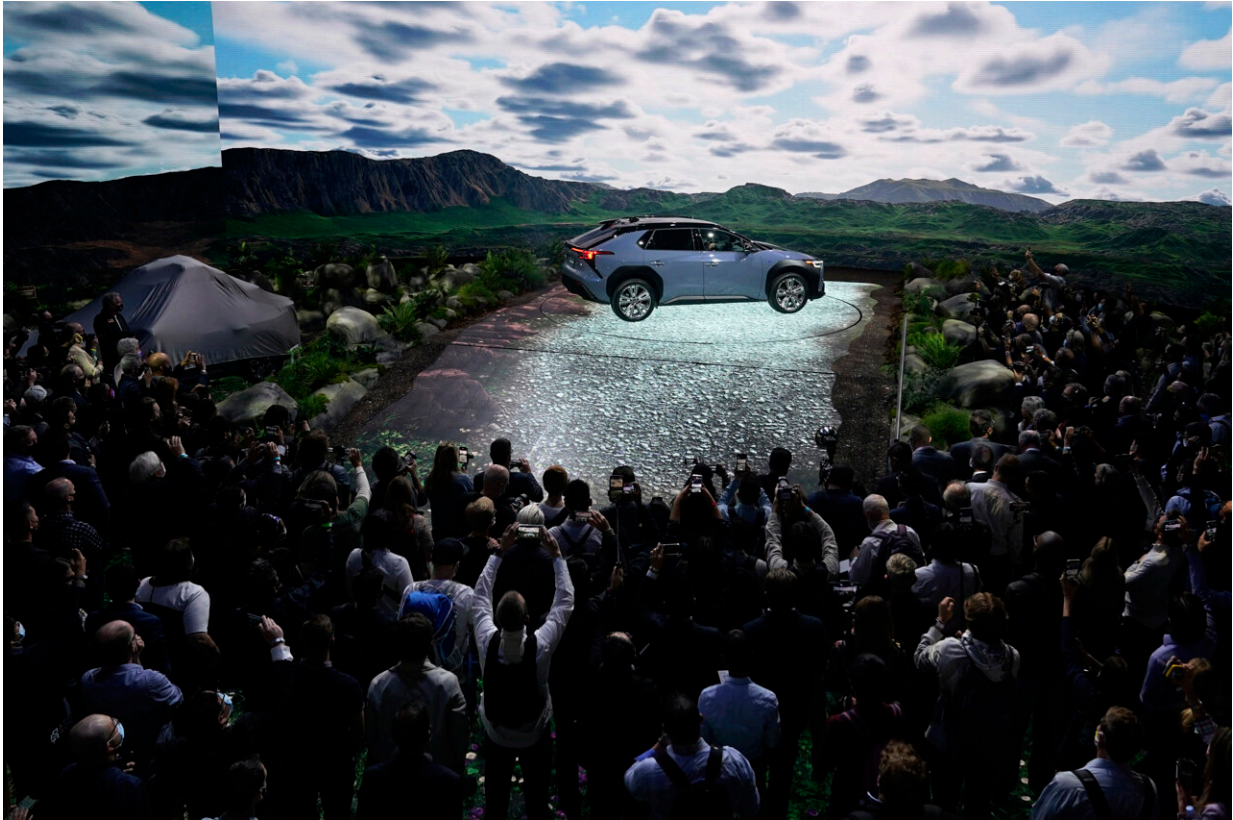
The 2023 Subaru Solterra EV is introduced at the AutoMobility LA auto show Wednesday, Nov. 17, 2021, in Los Angeles.