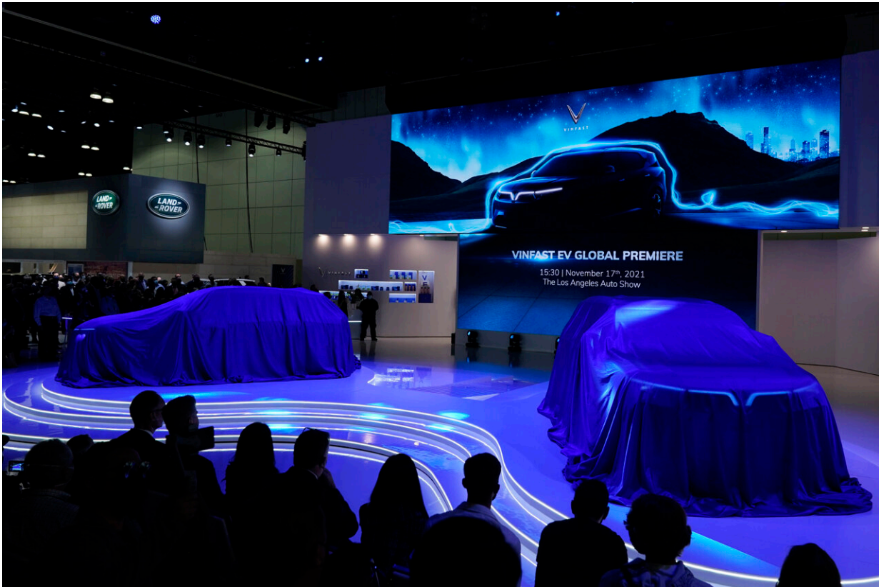
Attendees wait for the unveiling of the VinFast VF e35 and VF e36 EVs at the AutoMobility LA Auto Show Wednesday, Nov. 17, 2021, in Los Angeles.