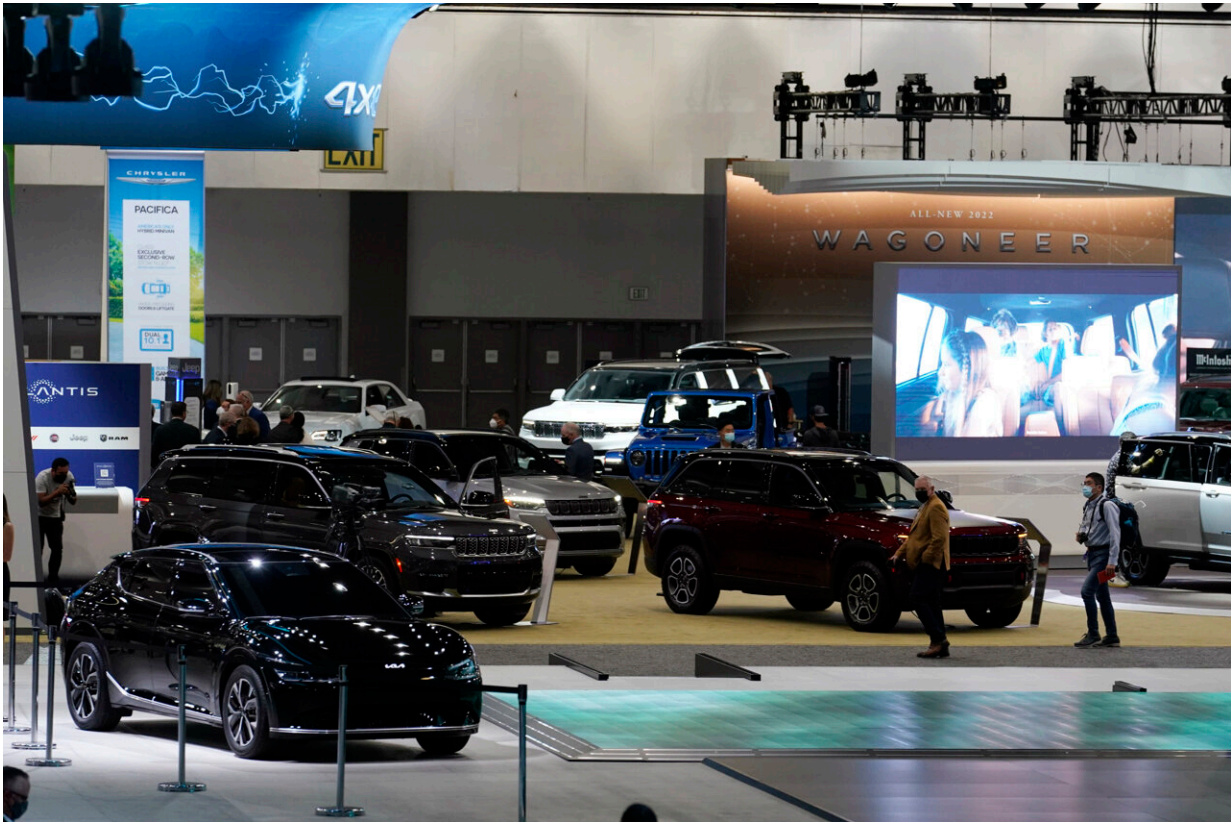
Cars from various automakers are displayed at the AutoMobility LA auto show Wednesday, Nov. 17, 2021, in Los Angeles.