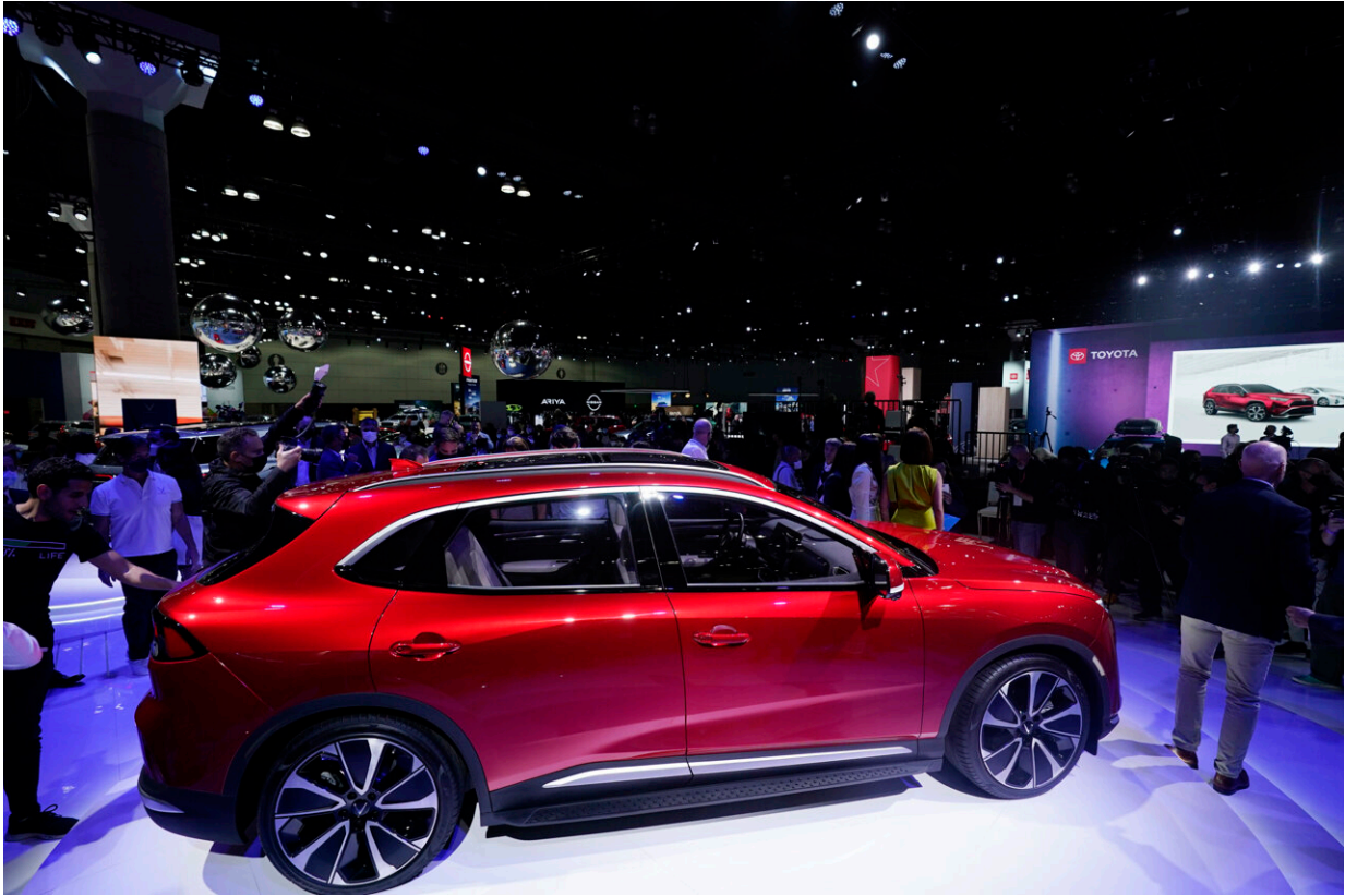
The new VinFast VF e35 EV is shown at the AutoMobility LA auto show Wednesday, Nov. 17, 2021, in Los Angeles.