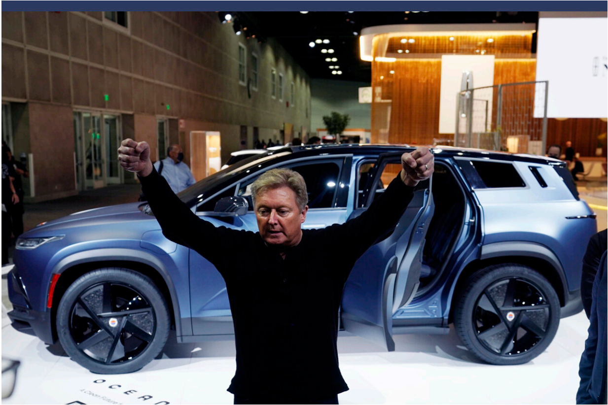
Henrik Fisker, Chairman & CEO at Fisker Inc. stands in front of the company's new EV, the Ocean, at the AutoMobility LA Auto Show Wednesday, Nov. 17, 2021, in Los Angeles.