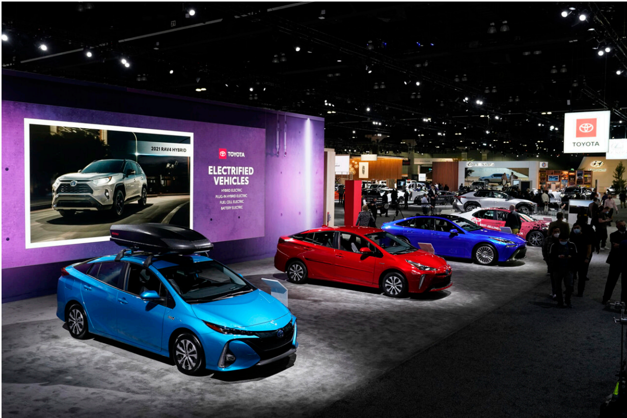
Toyota's lineup of electric and hybrid vehicles are displayed at the AutoMobility LA Auto Show Wednesday, Nov. 17, 2021, in Los Angeles.