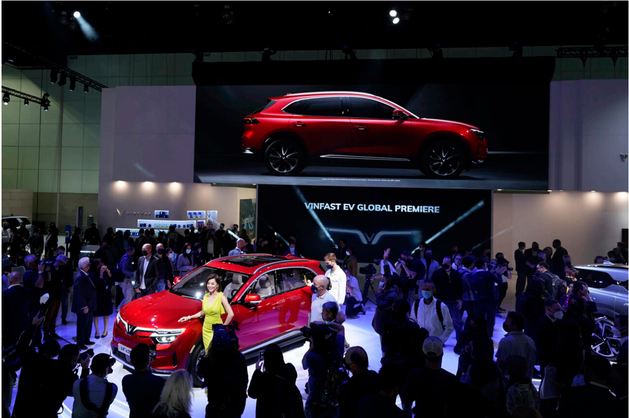
The new VinFast VF e35 EV is shown at the AutoMobility LA auto show Wednesday, Nov. 17, 2021, in Los Angeles.