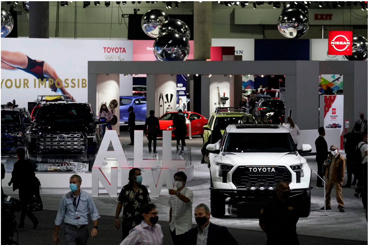
Cars from various automakers are displayed at the AutoMobility LA auto show Wednesday, Nov. 17, 2021, in Los Angeles.