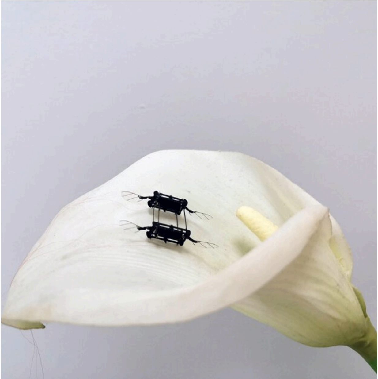
A microscale soft robot lands on a flower.

The actuators underpinning MIT's newly developed sub-gram robot work like a pair of soft capacitors. In other words, when voltage is applied to them, an electrostatic force squeezes the actuators and causes them to deform, similarly to how human and animal muscles contract.