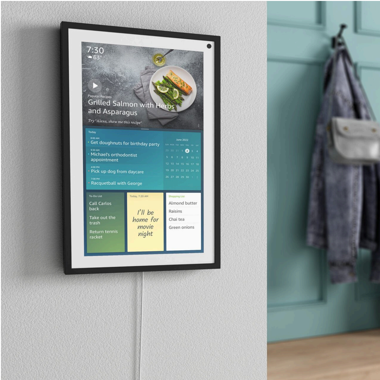
Amazon's Echo Show 15.

If you're worried about privacy, the device has a shutter to cover the camera and the option to mute the microphone.