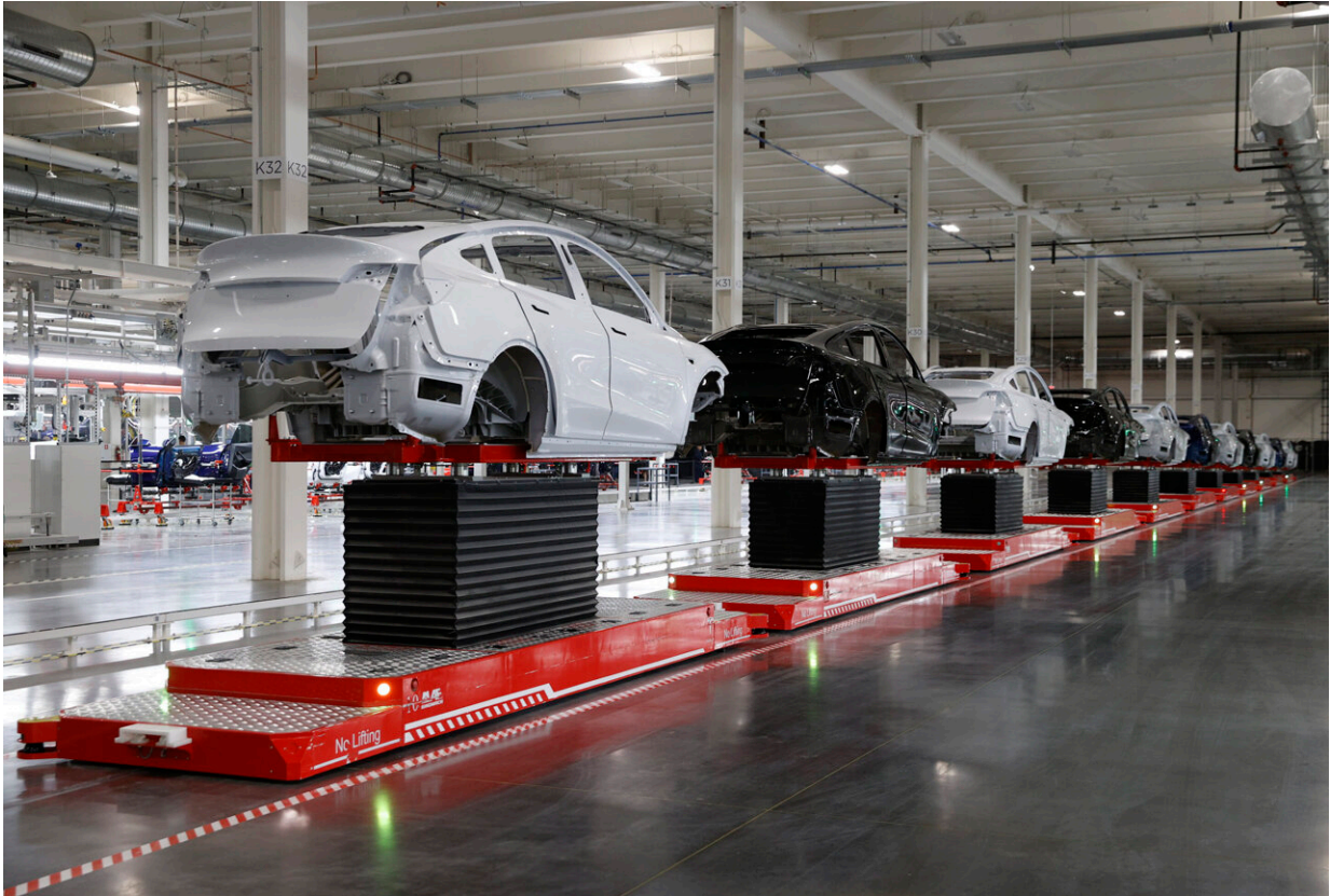
Cars on the manufacturing floor at the "Cyber Rodeo" grand opening celebration for the new $1.1 billion Tesla Giga Texas manufacturing facility in Austin, Texas, on Thursday April 7, 2022. The event marks the opening of the new factory in Travis County, which is Tesla's new home after a move from California.