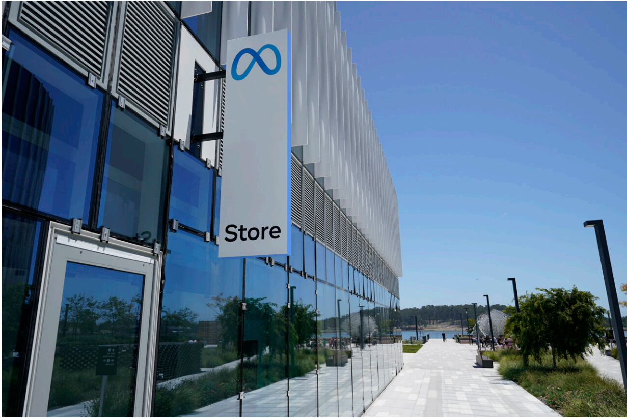
The exterior of the Meta Store is seen in Burlingame, Calif., Wednesday, May 4, 2022.