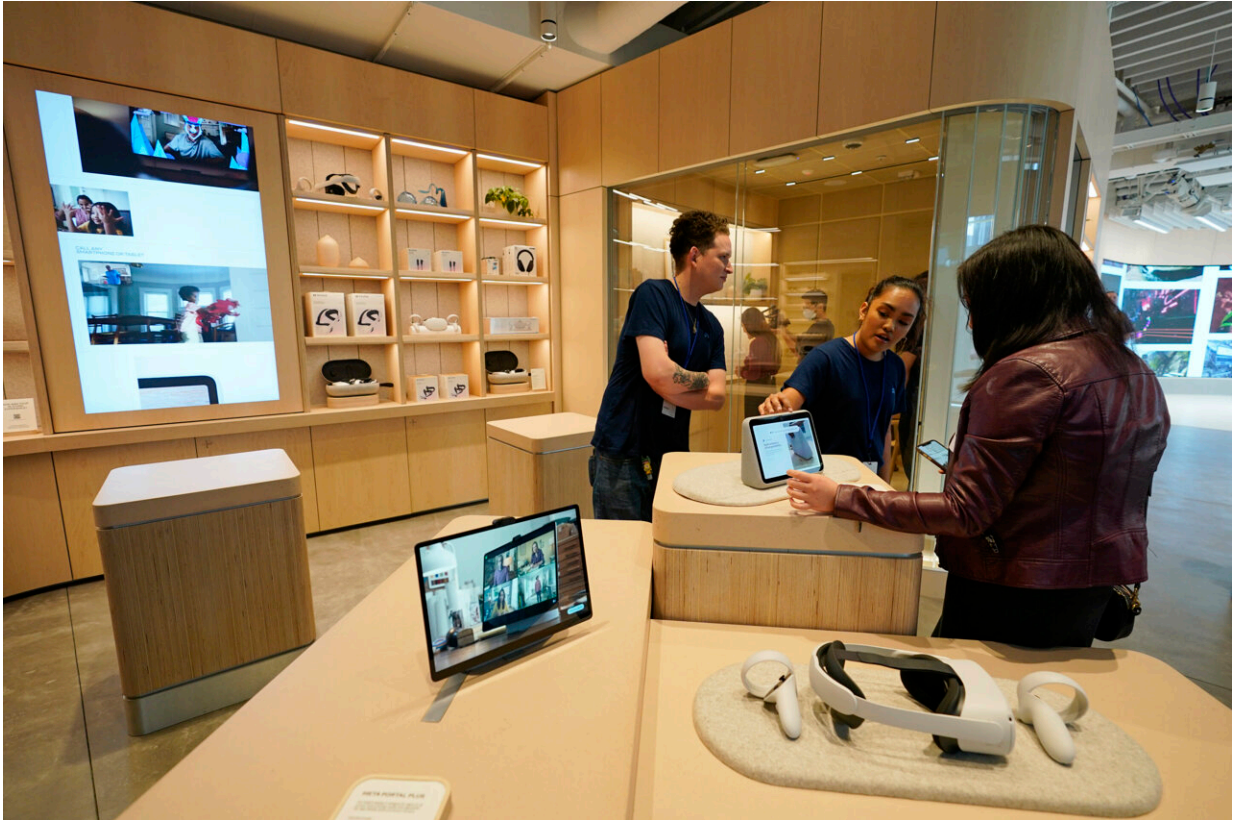
A woman examines the Meta Portal Go during a preview of the Meta Store in Burlingame, Calif., Wednesday, May 4, 2022.