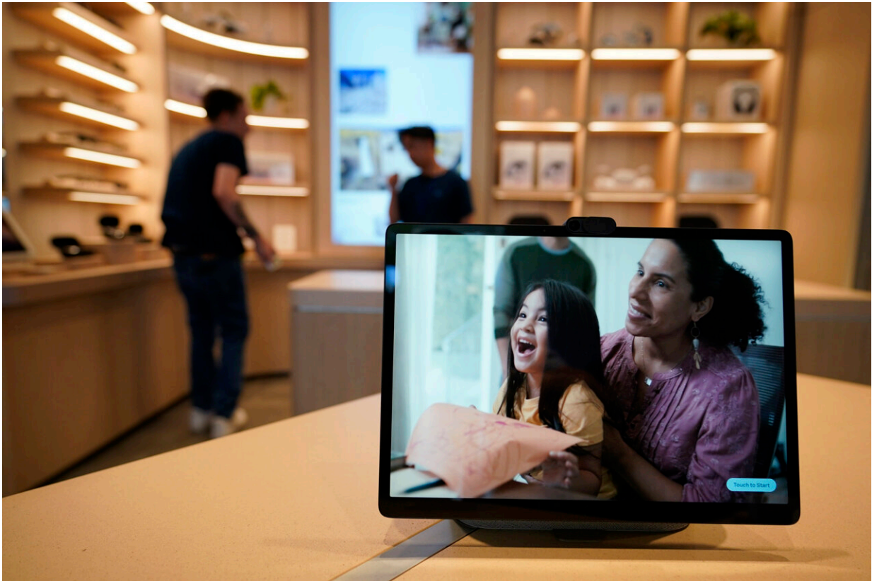
A Meta Portal Plus is displayed during a preview of the Meta Store in Burlingame, Calif., Wednesday, May 4, 2022.