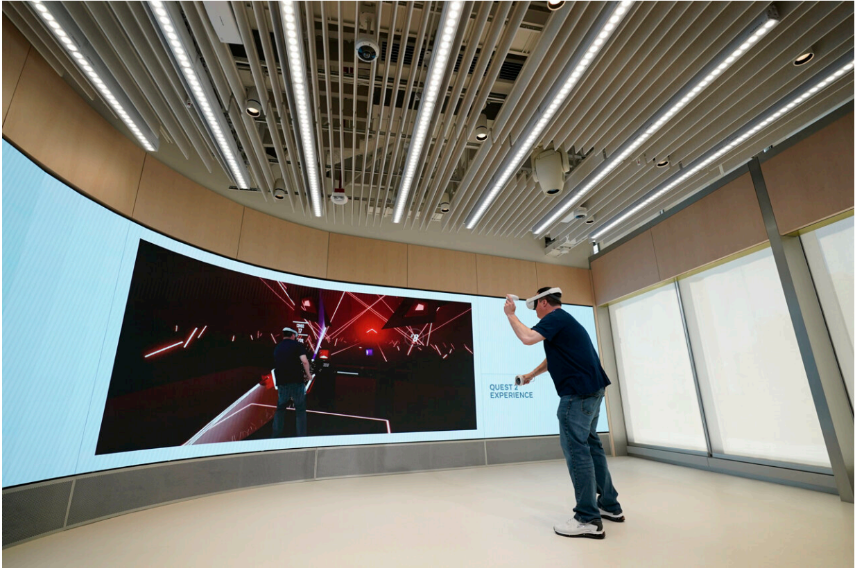
A man experiences the Quest 2 virtual headset during a preview of the Meta Store in Burlingame, Calif., Wednesday, May 4, 2022.