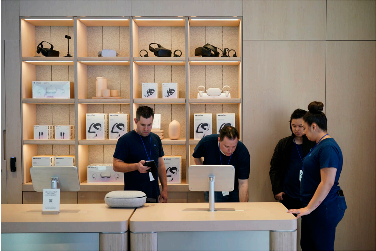
Meta experience experts gather during a preview of the Meta Store in Burlingame, Calif., Wednesday, May 4, 2022.