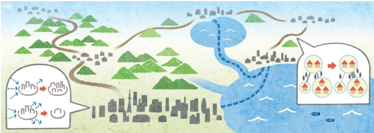
Illustration of dynamical pattern formation in the model in this study where populated places and their inter-connections emerge naturally across the landscape. Transport links following least-cost paths across the landscape are strengthened between locations with large populations, whilst well-connected centers in turn tend to grow to a greater extent.

The phrase "All roads lead to Rome" captures in five words how important roads are for important cities. Yet, when we think of what made some towns last and grow and others shrink and be forgotten, we often think first of cultural and political events, the climate, land productivity and geography. As a consequence, most current scientific models of how cities develop treat roads as by-products or exogenous