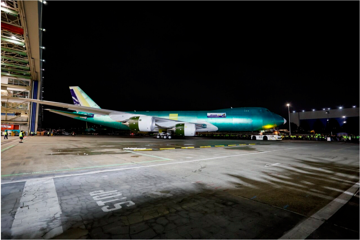
The final Boeing 747 aircraft pauses on the apron after rolling out of the hangar for the first time at the Everett factory, Tuesday night, Dec. 6, 2022, in Everett, Wash.