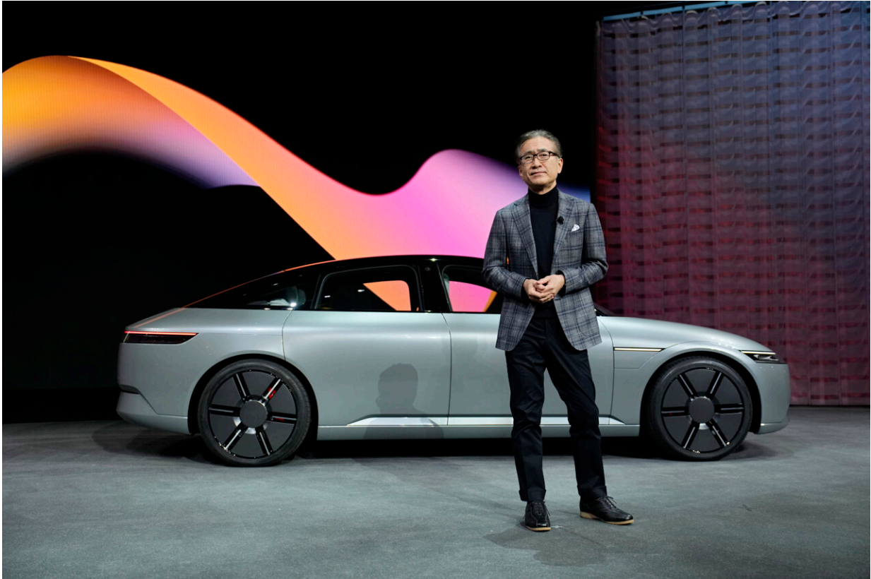
Kenichiro Yoshida, chairman, president and CEO of the Sony Group Corporation, stands in front of a newly unveiled electric vehicle prototype car Afeela, a joint venture between Sony and Honda, during a Sony news conference before the start of the CES tech show Wednesday, Jan. 4, 2023, in Las Vegas.