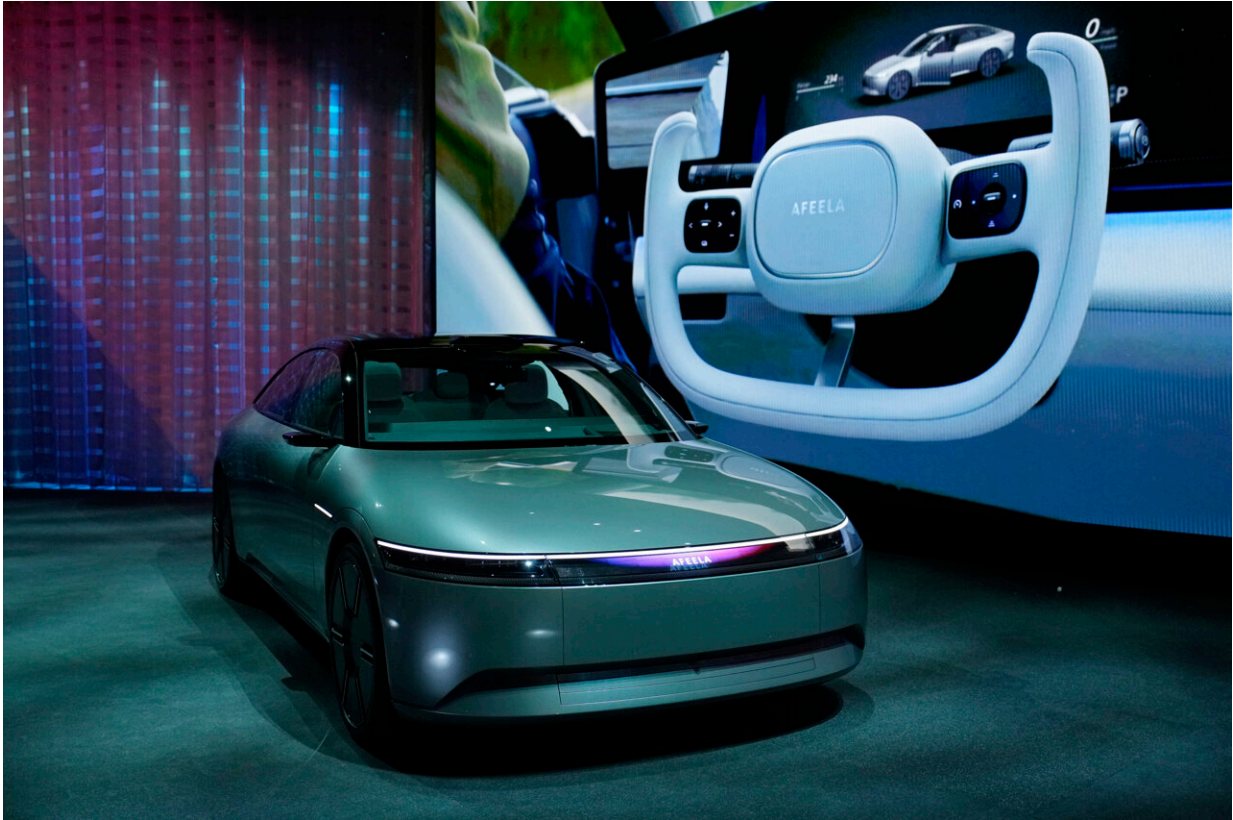
The electric vehicle prototype car Afeela, a joint venture between Sony and Honda, is on display during a Sony news conference before the start of the CES tech show Wednesday, Jan. 4, 2023, in Las Vegas.