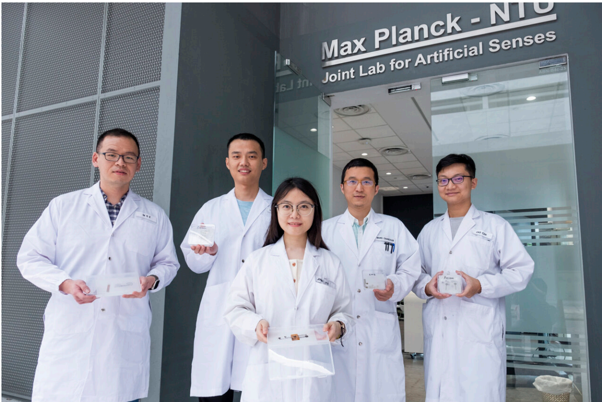
Members of the NTU Singapore research team behind the BIND interface.

contraction and relaxation, even underwater.