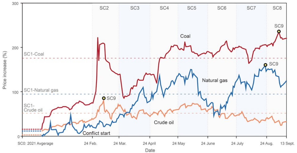
Price increases for fossil fuels compared with the 2021 average.

The wide uncertainty is because such a big part of the increase in household expenditure is for indirect energy consumption—energy used to produce the stuff or food that we consume. So for instance if someone in South Africa eats imported beef, the price of that beef might be affected by the cost of energy for the fertilizer (from Germany, perhaps) that is used to produce soybeans in Brazil which then feed the cows, along with the associated costs of fuel for transport. Factoring in lots of things like this means we cannot be too precise.