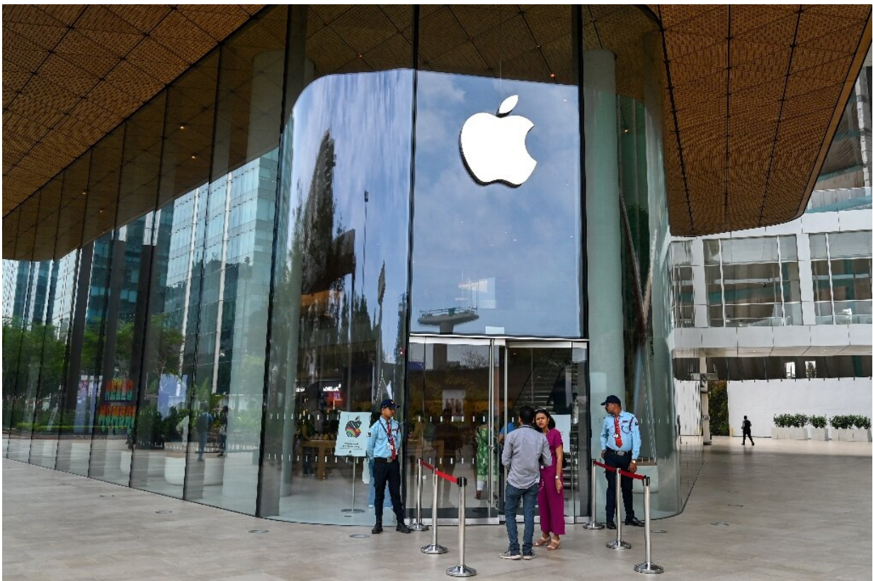
A new Apple retail store is pictured on the eve of its opening in Mumbai.

Chinese smartphone makers Xiaomi, vivo, OPPO and realme had a combined market share of 66 percent in 2022, according to research firm Canalys, while Samsung held a 19 percent share.