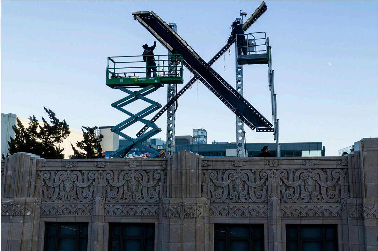
Workers install lighting on an "X" sign atop the downtown San Francisco building that housed what was formally known as Twitter, now rebranded X by owner Elon Musk, Friday, July 28, 2023.