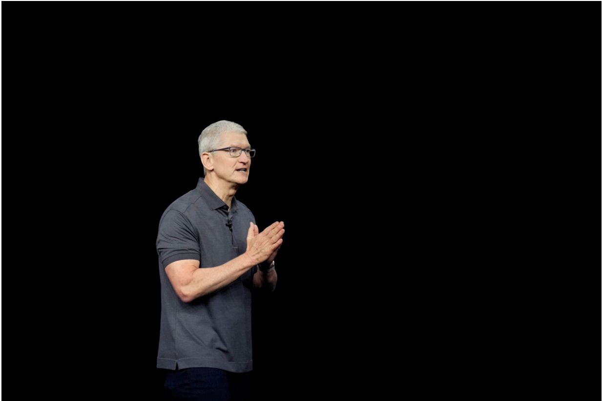
Apple CEO Tim Cook speaks during an announcement of new products on the Apple campus Tuesday, Sept. 12, 2023, in Cupertino, Calif.