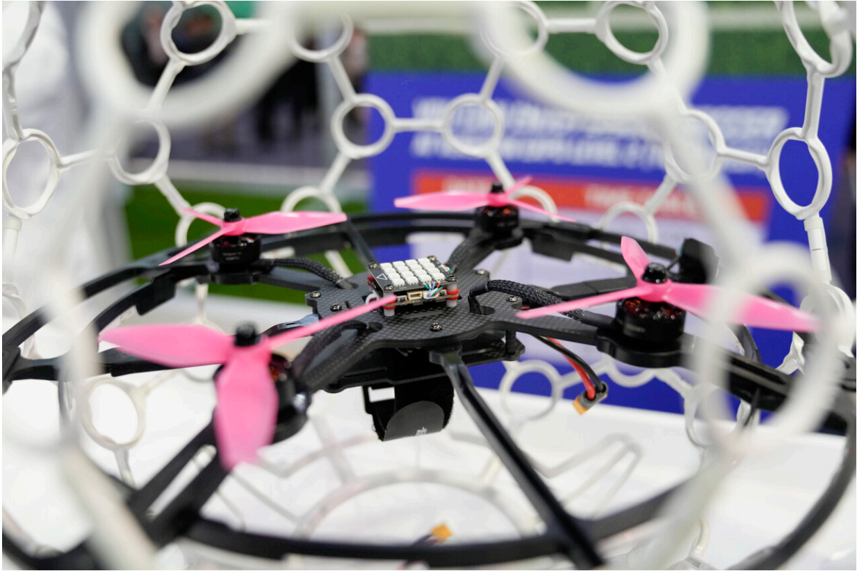
A DroneSoccer model is displayed during the CES tech show Tuesday, Jan. 9, 2024, in Las Vegas.