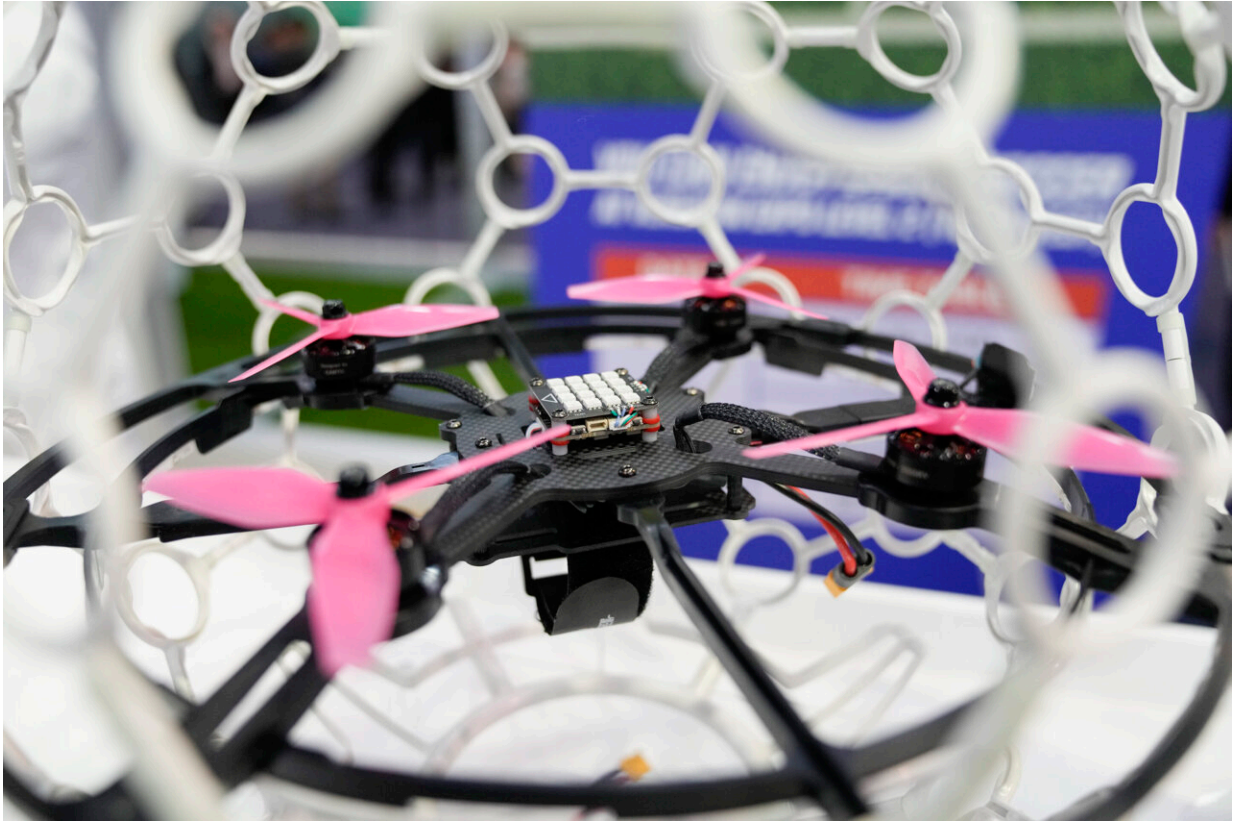
A DroneSoccer model is displayed during the CES tech show Tuesday, Jan. 9, 2024, in Las Vegas.