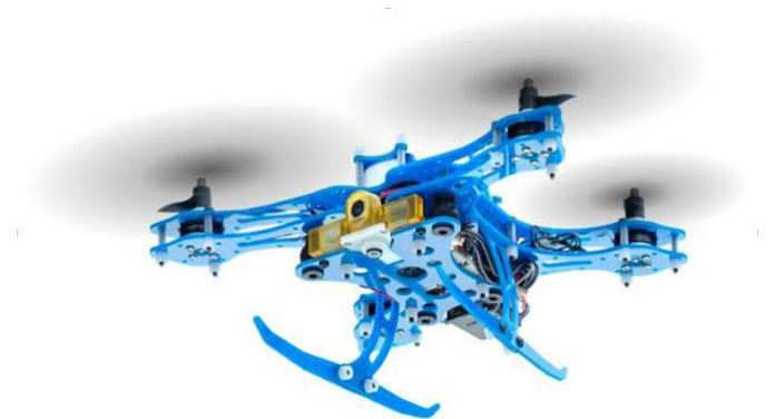
Snapdragon Flight reference drone

The platform is based on the Snapdragon 801 processor, and Snapdragon Flight handles 4K video. The smart drone transmits data or communicates using dual-band 2x2 802.11n Wi-Fi and Bluetooth 4.0.