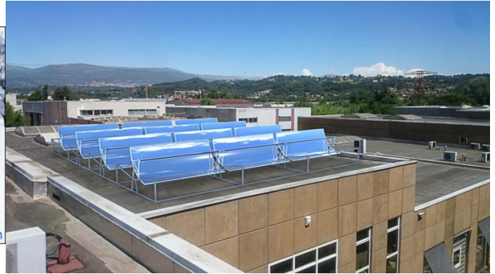
Helioclim's air-conditioning system.