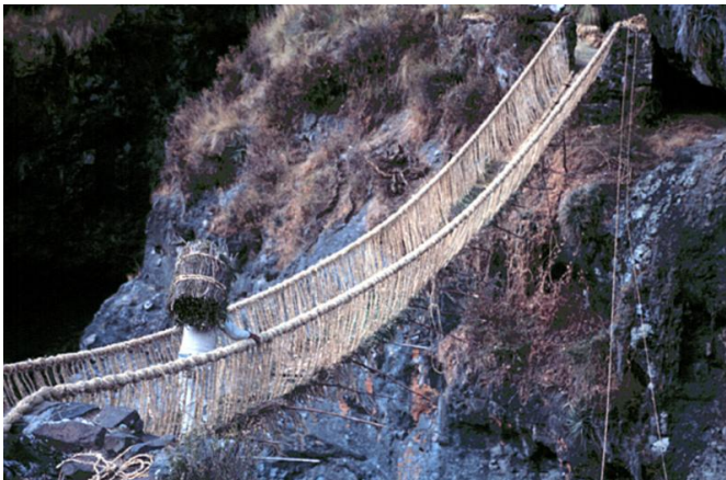
A simple woven suspension bridge.

Conventional wisdom would suggest an infrastructure project is done soon after its inauguration. But keeping the Golden Gate Bridge in tiptop form requires ongoing stringent maintenance. For 80 years, dedicated maintenance crews have serviced the bridge, repainting and substituting the corroded or broken components where necessary.