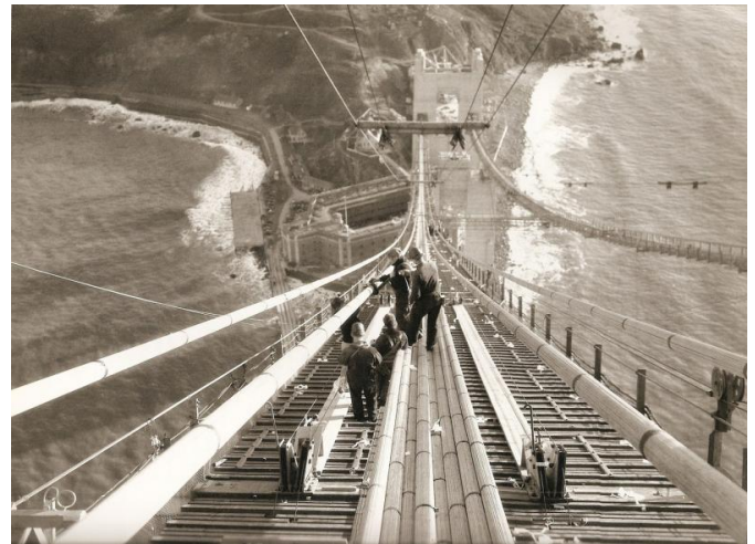
Workers during construction of the bridge, circa 1935.

Since people first started pondering a bridge in the bay of San Francisco, there was huge concern about the structure's ability to withstand the location's strong winds, turbulent waters and possible earthquake forces. San Francisco is located at the intersection of two active tectonic plates – obviously no one wanted to see an earthquake bring down the bridge, which currently carries around 112,000 vehicles per day .