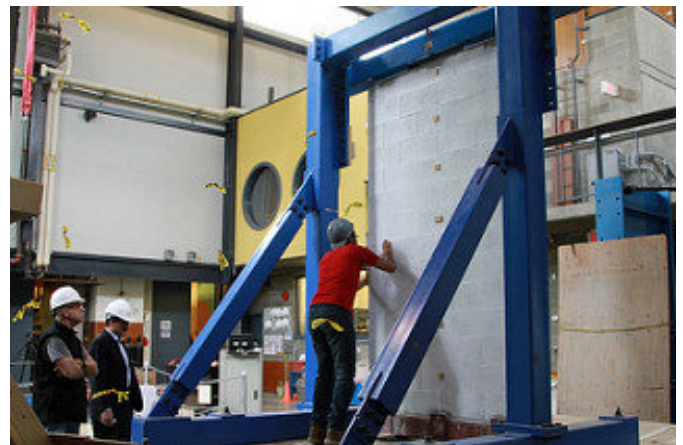
EDCC-reinforced wall being inspected for cracks and damage between earthquake simulation tests.

Other EDCC applications include resilient homes for First Nations communities, pipelines, pavements, offshore platforms, blast-resistant structures, and industrial floors.