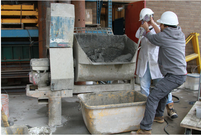
Mixing seismic-resistant concrete at UBC.

A new seismic-resistant, fibre-reinforced concrete developed at the University of British Columbia will see its first real-life application this fall as part of the seismic retrofit of a Vancouver elementary school.