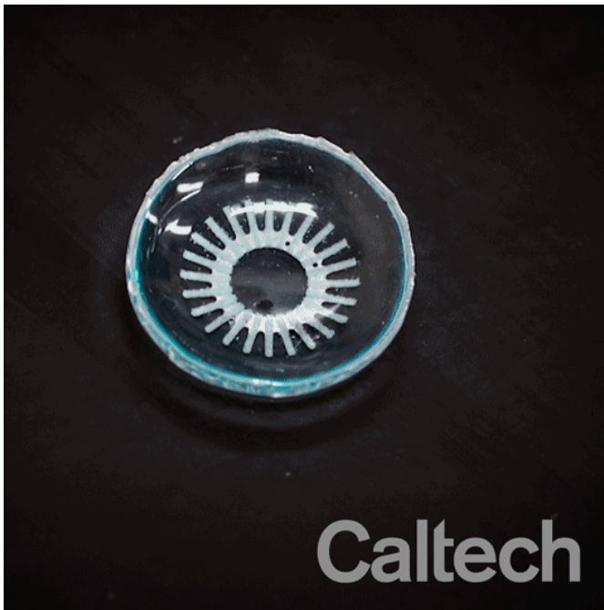
The contact lens as it appears in lighted and dark conditions.

To provide light to the retina throughout the night, the lenses borrow technology from wristwatches that have glowing markers on their faces. The illumination is provided by tiny vials filled with tritium, a radioactive form of hydrogen gas that emits electrons as it decays. Those electrons are converted into light by a phosphorescent coating. This system ensures a constant light output for the lifetime of the contact lens.