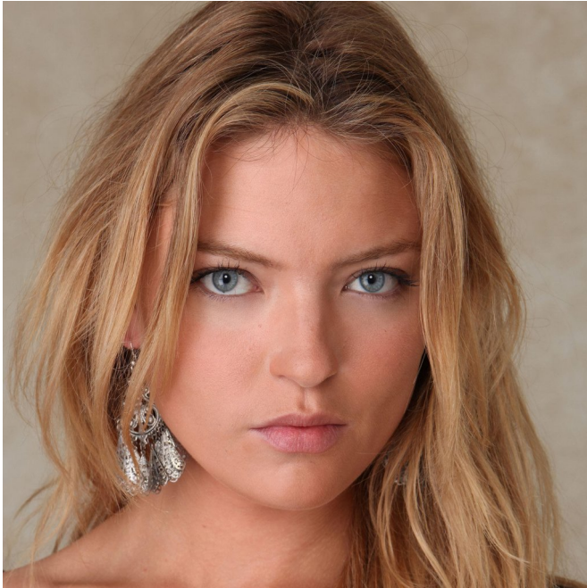
Example of real face image from dataset provided by paper "Progressive Growing of GANs for Improved Quality, Stability, and Variation".

Researchers at Shenzhen University have recently devised a method to detect images generated by deep neural networks. Their study, pre-published on arXiv , identified a set of features to capture color image statistics that can detect images generated using current artificial intelligence tools.