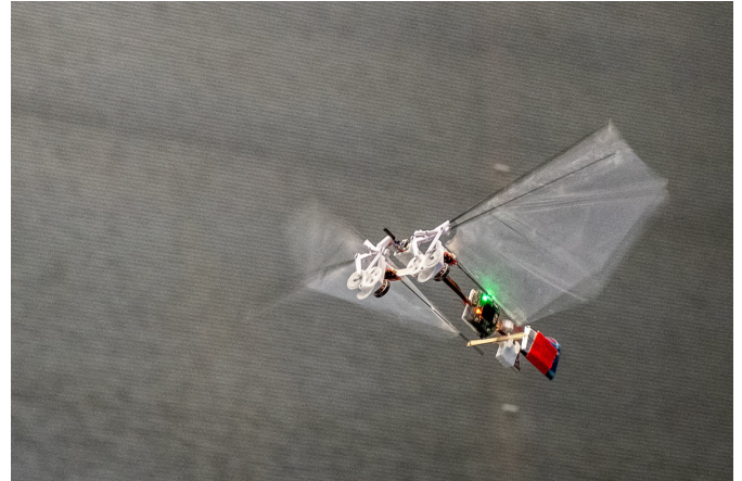
DelFly Nimble (left) performs rapid turns that closely resemble those of fruit flies when we try to swat them (right).

agility, and they required an overly complex manufacturing process." The robot in this study, named the DelFly Nimble, builds on established manufacturing methods, uses off-the-shelf components, and its flight endurance is long enough to be of interest for real-world applications.