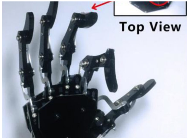
Sensory skins mounted on the fingers of a mechanical arm.

A team of researchers working at the Chinese Academy of Sciences has developed an electronic skin that is sensitive enough to detect changes in air moving, falling drops and moving ants. In their paper published in the journal Science Robotics , the group describes their e-skin and possible applications.