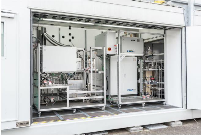
BIOGO mini-plant in a container.

More than four billion tons of crude oil are produced every year, and electricity from wind, solar and hydropower plants cannot entirely supplant fossil sources of energy. At best, renewables could cover the energy needed to power all electric cars and to generate hydrogen for fuel cell vehicles. Even then, gasoline would still be required to power combustion engines, which will be operating for decades to come. The only sustainable way to keep us mobile is to replace this gasoline with alternative fuels.